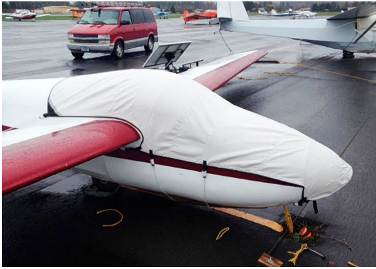
SGS 1-26B Canopy/Nose Cover

the hottest of days. It is water, ice and snow repellent, yet breathable to allow moisture to escape from between the cover and the aircraft surface.