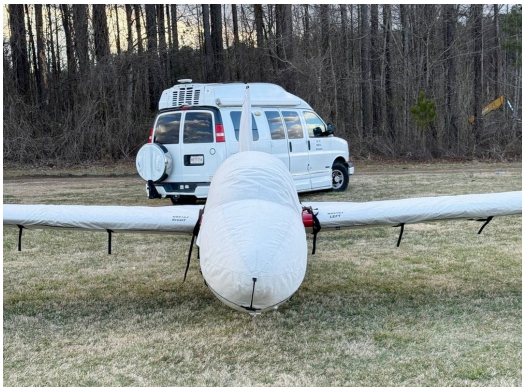
Schweizer SGS 2-32 Complete Cover Set

WINTER USE MATERIAL - Made with Solution-Dyed Polyester fabric, this option is intended for seasonal use to aid in deicing, rain mitigation, or for occasional travel. The material is lighter and more compact, but more susceptible to UV damage and may have a shorter useful life if used continuously outside than the all-year use material.