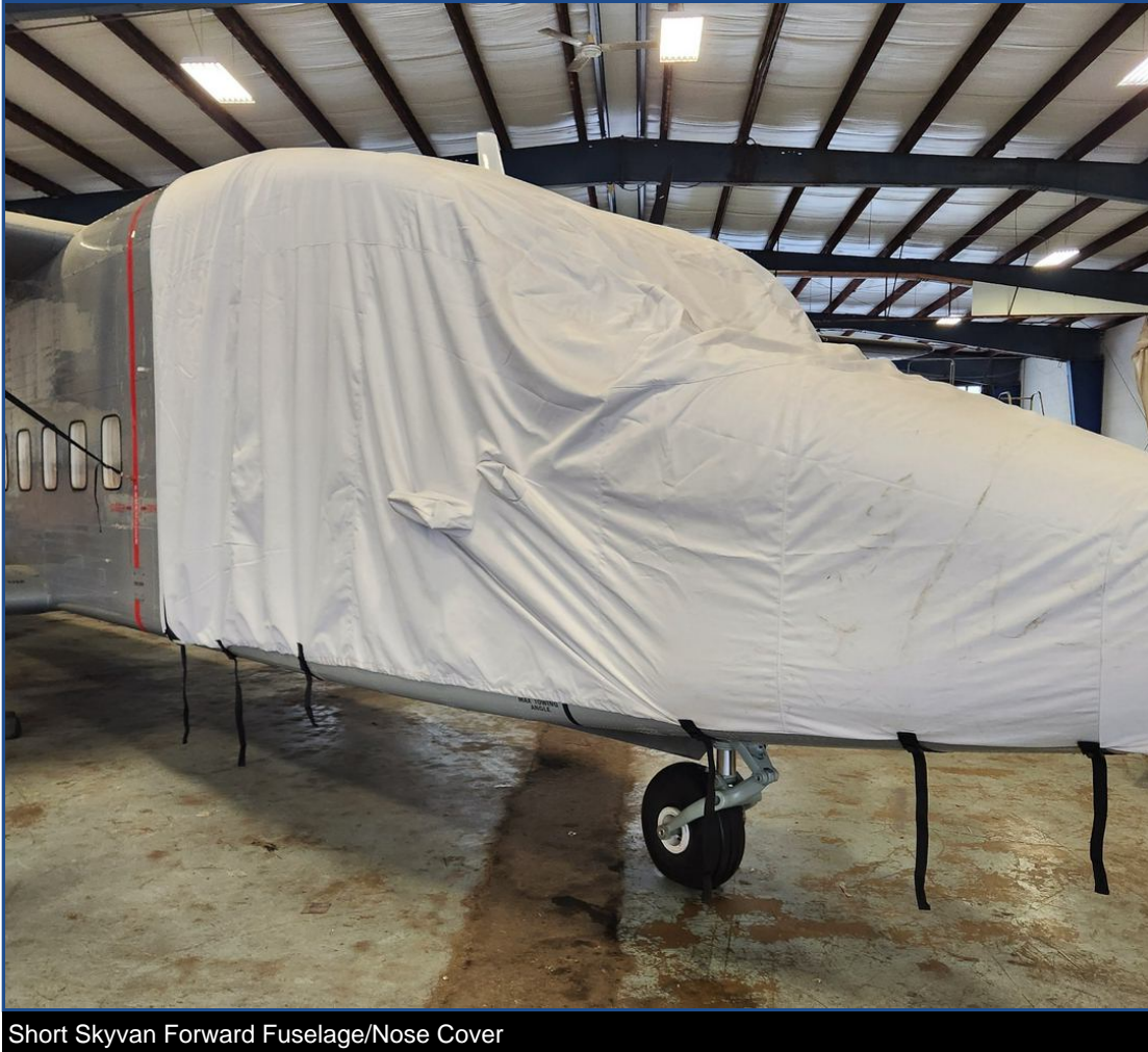
Short Skyvan Forward Fuselage/Nose Cover