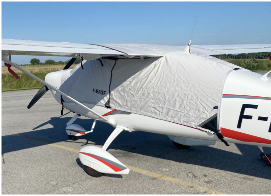
Tecnam P2010 Over-Top Canopy Cover