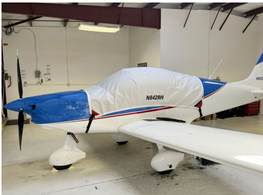
Airplane Factory Sling 2 Canopy Cover

This cover type is made from Silver Acrylic Sunbrella canvas and is 100% lined with a soft and smooth microfiber. Bruce's Custom Covers developed this material combination especially for aircraft protection. The outer material is medium weight and treated for water resistance, UV resistance and anti-static buildup. The inner lining is a very soft and smooth microfiber to prevent scratching. The material is very reflective, and tests show that the cabin interior temperature can be reduced to near-ambient temperature on the hottest of days. It is water, ice and snow repellent, yet breathable to allow moisture to escape from between the cover and the aircraft surface.