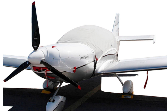
Sportcruiser Canopy Cover & Plugs

Travel Covers are made with Silver Solution-Dyed Polyester fabric and only lined over the windshield to save weight. The material is lightweight and more compact for easy stowage in the aircraft. The polyester material is water resistant, but only intended for occasional use outside. We also have an ultra lightweight material available for fitted hangar dust covers. For daily outdoor use, the non-travel Sunbrella Cover is the best choice.