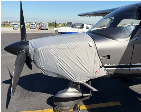
Sling High Wing Engine Cover

This cover type is made from Silver Acrylic Sunbrella canvas and is 100% lined with a soft and smooth microfiber. Bruce's Custom Covers developed this material combination especially for aircraft protection. The outer material is medium weight and treated for water resistance, UV resistance and anti-static buildup. The inner lining is a very soft and smooth microfiber to prevent scratching. The material is very reflective, and tests show that the cabin interior temperature can be reduced to near-ambient temperature on the hottest of days. It is water, ice and snow repellent, yet breathable to allow moisture to escape from between the cover and the aircraft surface.