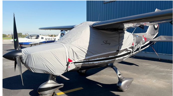
Sling High Wing Canopy Cover & Engine Cover