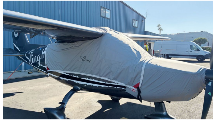
Sling High Wing Canopy Cover & Engine Cover