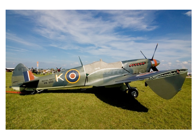
Supermarine Spitfire Mk IX Canopy Cover