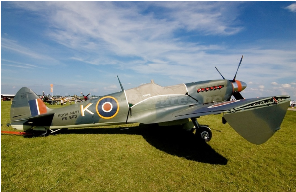
Supermarine Spitfire Mk IX Canopy Cover

Travel Covers are made with Silver Solution-Dyed Polyester fabric and only lined over the windshield to save weight. The material is lightweight and more compact for easy stowage in the aircraft. The polyester material is water resistant, but only intended for occasional use outside. We also have an ultra lightweight material available for fitted hangar dust covers. For daily outdoor use, the non-travel Sunbrella Cover is the best choice.