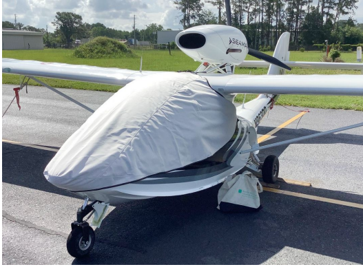
Seamax Canopy/Nose Cover

The material is very reflective, and tests show that the cabin interior temperature can be reduced to near-ambient temperature on the hottest of days. It is water, ice and snow repellent, yet breathable to allow moisture to escape from between the cover and the aircraft surface.