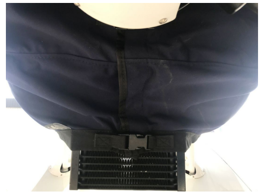
Seamax M22 Engine Cover