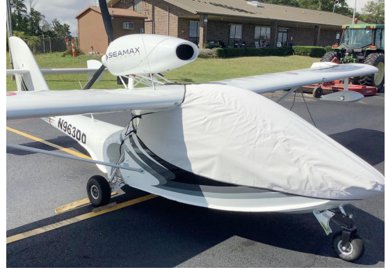
Seamax Canopy/Nose Cover