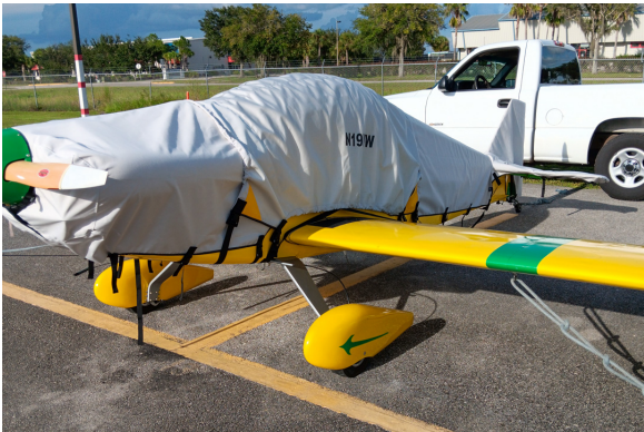
Sonerai Racer Extended Canopy Cover

This cover type is made from Silver Acrylic Sunbrella canvas and is 100% lined with a soft and smooth microfiber. Bruce's Custom Covers developed this material combination especially for aircraft protection. The outer material is medium weight and treated for water resistance, UV resistance and anti-static buildup. The inner lining is a very soft and smooth microfiber to prevent scratching. The material is very reflective, and tests show that the cabin interior temperature can be reduced to near-ambient temperature on the hottest of days. It is water, ice and snow repellent, yet breathable to allow moisture to escape from between the cover and the aircraft surface.