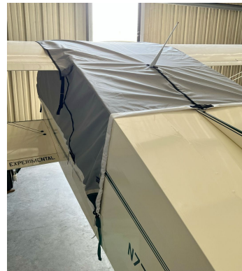
Sorrell SNS-7 Hiperbipe Over The Top Travel Canopy Cover