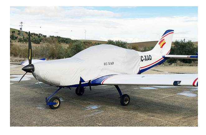
Czech Aircraft Works SportCruiser Canopy/Engine Cover

This cover type is made from Silver Acrylic Sunbrella canvas and is 100% lined with a soft and smooth microfiber. Bruce's Custom Covers developed this material combination especially for aircraft protection. The outer material is medium weight and treated for water resistance, UV resistance and anti-static buildup. The inner lining is a very soft and smooth microfiber to prevent scratching. The material is very reflective, and tests show that the cabin interior temperature can be reduced to near-ambient temperature on the hottest of days. It is water, ice and snow repellent, yet breathable to allow moisture to escape from between the cover and the aircraft surface.