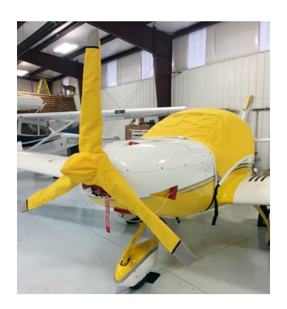
Custom Yellow Canopy Cover, Prop/Spinner, and Inlet Plugs

Engine Inlet Plugs are custom fit for your Czech Aircraft Works SportCruiser intakes, made with heavy-duty vinyl material, and stuffed with a single block of sculpted urethane foam. Each plug has a zipper that allows the foam to be removed and dried if necessary. Engine plugs have warning flags that are visible from the cockpit or 'remove before flight' streamers sewn onto the face of the plugs. Most plugs are imprinted with the aircraft registration number in black for an extra charge. Storage bag NOT included. Engine plugs may be inserted after flight when the engine is still warm. Engine Inlet Plugs are commonly referred to as Cowl Plugs, Intake Plugs, Cowl Blocks, Engine Blocks, and Engine Bungs.