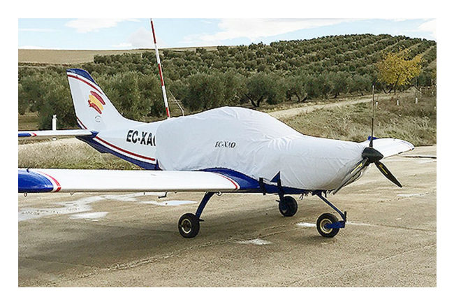
Czech Aircraft Works SportCruiser Canopy/Engine Cover