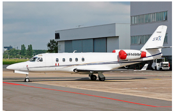
IAI-1125A Astra SPX Engine Cover set