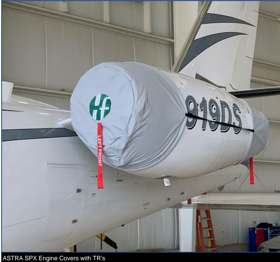
ASTRA SPX Engine Covers with TR's