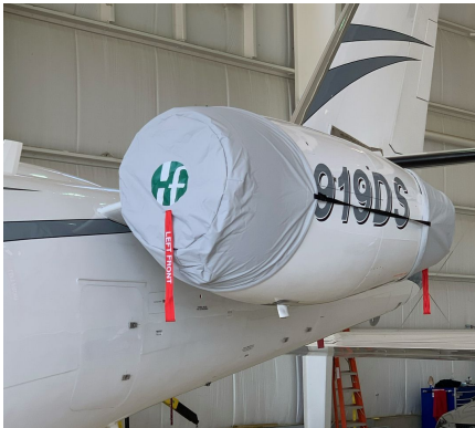
ASTRA SPX Engine Covers with TR's

The Israel Aircraft Industries Astra SPX Bikini Style Engine Covers are a single-piece design using a soft and smooth stretchy and fabric. The cover stretches tightly over both the intake and exhaust, installing quickly and easily. These covers are designed to be used as hangar dust covers and have a useful life of approximately one year.