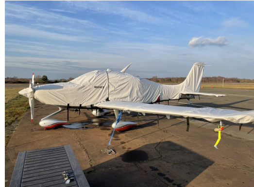
Cirrus SR-22 Complete Cover Set