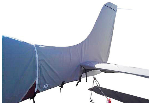
Cirrus SR20 Empennage Cover (covers tail boom, vertical and horizontal stabilizers)

WINTER USE MATERIAL - Made with Solution-Dyed Polyester fabric, this option is intended for seasonal use to aid in deicing, rain mitigation, or for occasional travel. The material is lighter and more compact, but more susceptible to UV damage and may have a shorter useful life if used continuously outside than the all-year use material.