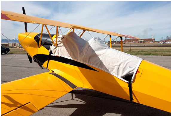
Bucker Jungmann Canopy Cover