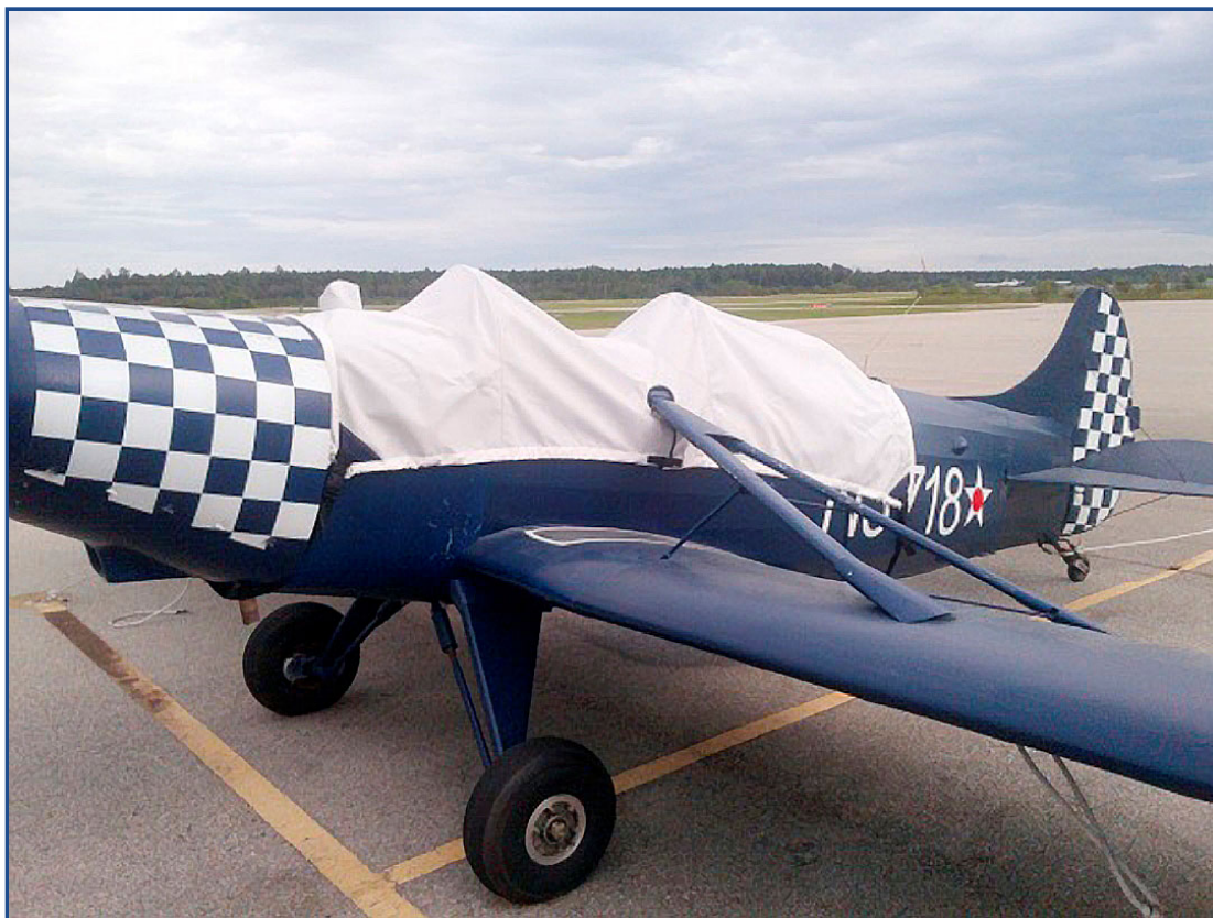
Spezio Tuholer Canopy Cover