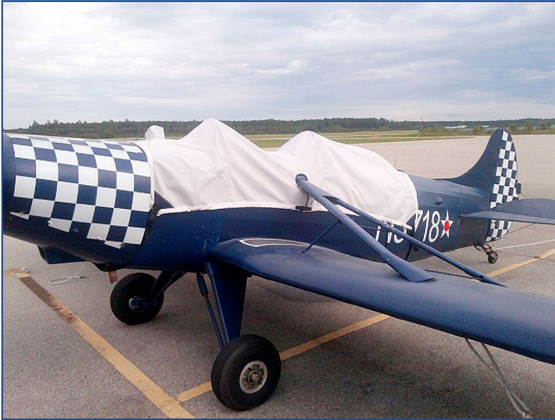
Spezio Tuholer Canopy Cover