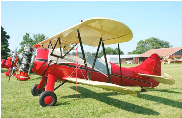
Waco YMF Canopy Cover

The Spezio Tuholer Canopy/Engine Cover is a one-piece cover (100% lined with microfiber) that is a combination of the Canopy Cover and Engine Cover. This cover will enclose the engine cowl and will extend aft to cover all of the windows. This cover type is made from Silver Acrylic Sunbrella canvas and is 100% lined with a soft and smooth microfiber. Bruce's Custom Covers developed this material combination especially for aircraft protection. The outer material is medium weight and treated for water resistance, UV resistance and anti-static buildup. The inner lining is a very soft and smooth microfiber to prevent scratching. The material is very reflective, and tests show that the cabin interior temperature can be reduced to near-ambient temperature on the hottest of days. It is water, ice and snow repellent, yet breathable to allow moisture to escape from between the cover and the aircraft surface.