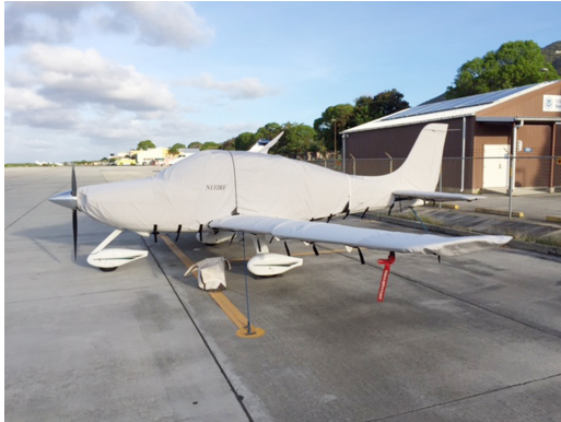
Cirrus SR-22 Full Cover Set

WINTER USE MATERIAL - Made with Solution-Dyed Polyester fabric, this option is intended for seasonal use to aid in deicing, rain mitigation, or for occasional travel. The material is lighter and more compact, but more susceptible to UV damage and may have a shorter useful life if used continuously outside than the all-year use material.