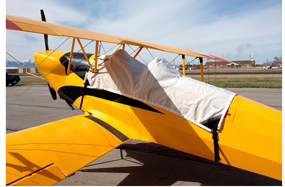
Bucker Jungmann Canopy Cover