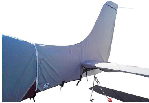
Cirrus SR20 Empennage Cover (covers tail boom, vertical and horizontal stabilizers)

WINTER USE MATERIAL - Made with Solution-Dyed Polyester fabric, this option is intended for seasonal use to aid in deicing, rain mitigation, or for occasional travel. The material is lighter and more compact, but more susceptible to UV damage and may have a shorter useful life if used continuously outside than the all-year use material.