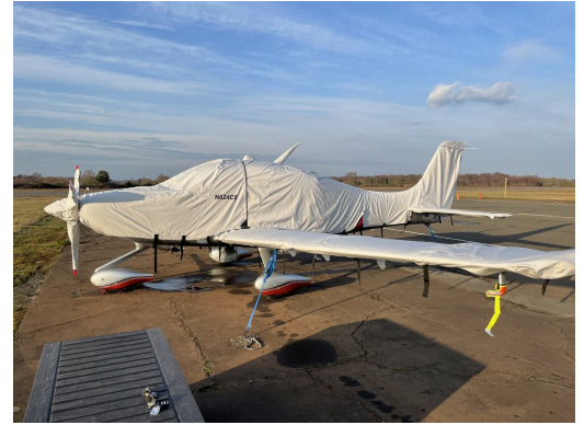
Cirrus SR-22 Complete Cover Set