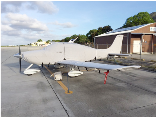
Cirrus SR-22 Full Cover Set