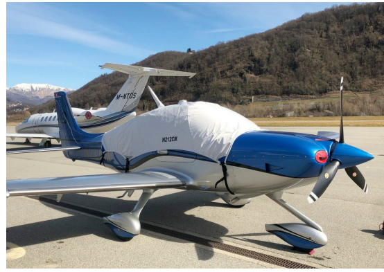
Cirrus SR-22 Canopy Cover (extends to cover parachute panel), Engine Plugs