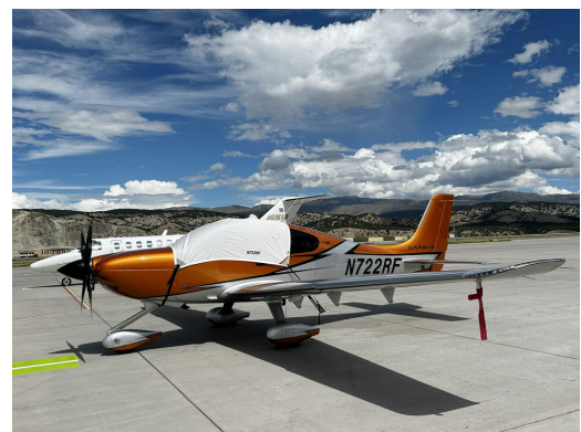
Cirrus SR22 Cockpit Cover, Windshield And Forward Side Windows