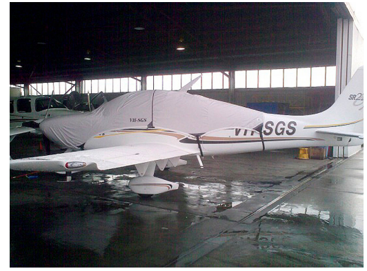
Cirrus SR22 Canopy/Engine Cover