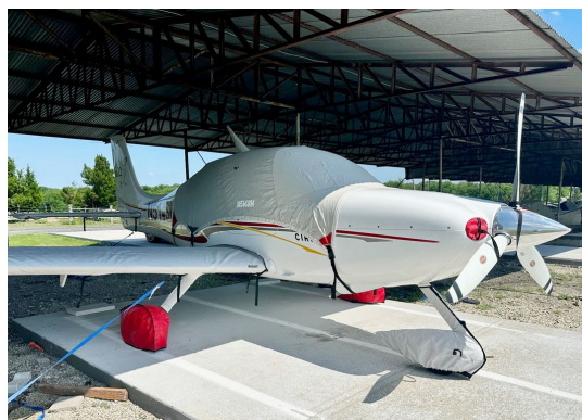
Cirrus SR-22 Wheelpant Covers