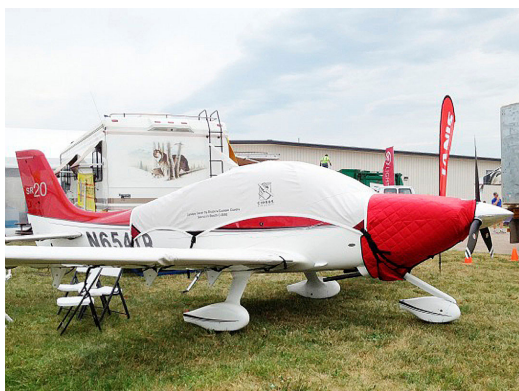
Cirrus SR22 Canopy Cover / Insulated Engine Cover / Wing Covers

This cover type is made from Silver Acrylic Sunbrella canvas and is 100% lined with a soft and smooth microfiber. Bruce's Custom Covers developed this material combination especially for aircraft protection. The outer material is medium weight and treated for water resistance, UV resistance and anti-static buildup. The inner lining is a very soft and smooth microfiber to prevent scratching. The material is very reflective, and tests show that the cabin interior temperature can be reduced to near-ambient temperature on the hottest of days. It is water, ice and snow repellent, yet breathable to allow moisture to escape from between the cover and the aircraft surface.