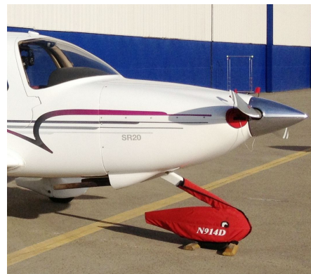
Cirrus SR20 Front Wheelpant/Strut Cover, Engine Plugs