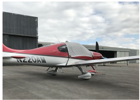
Cirrus SR-22 Cockpit Cover