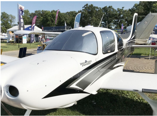
Cirrus SR-22 Cockpit HeatShields

Windshield Heatshields are interior sunshades for an aircraft's front windshield. The product is a unique composite of closed-cell foam with a silver mylar finish. The semi-rigid design is stiff enough to stand along the inside of the windshield using sun visors or window framing. It folds up flat and easily stores in the included storage sleeve. Some designs may require velcro and suction cups or split right and left sides. A Heatshield is an excellent short-term remedy for cockpit overheating. An external fabric cover is far more effective and practical for long-term protection.