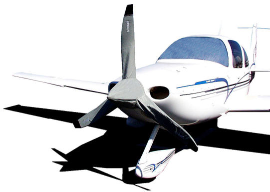
Cirrus SR-22 Propellor/Spinner Cover & Windshield Heatshield

Windshield Heatshields are interior sunshades for an aircraft's front windshield. The product is a unique composite of closed-cell foam with a silver mylar finish. The semi-rigid design is stiff enough to stand along the inside of the windshield using sun visors or window framing. It folds up flat and easily stores in the included storage sleeve. Some designs may require velcro and suction cups or split right and left sides. A Heatshield is an excellent short-term remedy for cockpit overheating. An external fabric cover is far more effective and practical for long-term protection.