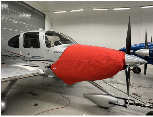
Cirrus SR-22 Insulated Engine Cover