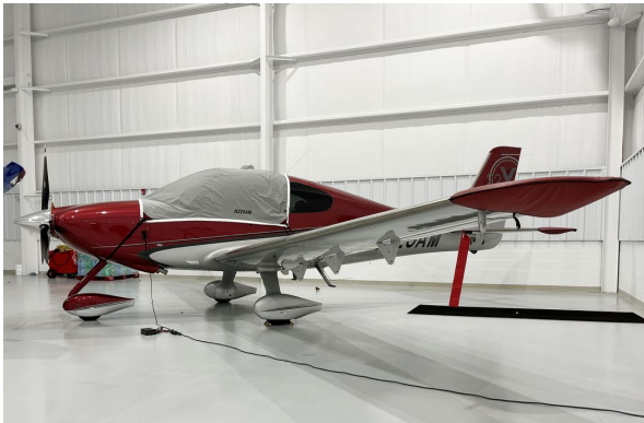
Cirrus SR-22 Cockpit Cover

Designed to prevent damage to the aircraft extremities in crowded hangars, these products are made of bright red Naugahyde and thickly padded with a sandwich of closed cell foam.