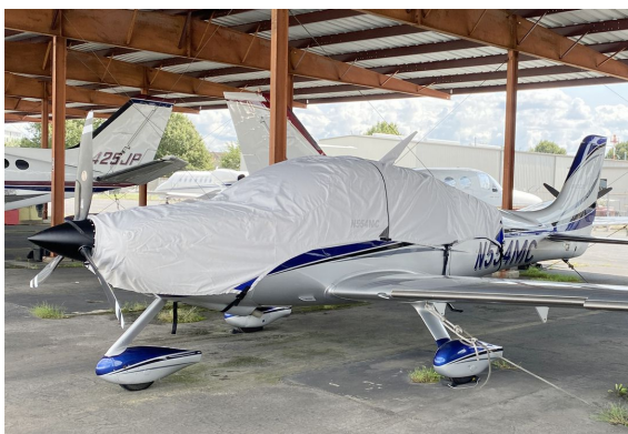
Cirrus SR22 Canopy/Engine Cover

This cover type is made from Silver Acrylic Sunbrella canvas and is 100% lined with a soft and smooth microfiber. Bruce's Custom Covers developed this material combination especially for aircraft protection. The outer material is medium weight and treated for water resistance, UV resistance and anti-static buildup. The inner lining is a very soft and smooth microfiber to prevent scratching. The material is very reflective, and tests show that the cabin interior temperature can be reduced to near-ambient temperature on the hottest of days. It is water, ice and snow repellent, yet breathable to allow moisture to escape from between the cover and the aircraft surface.