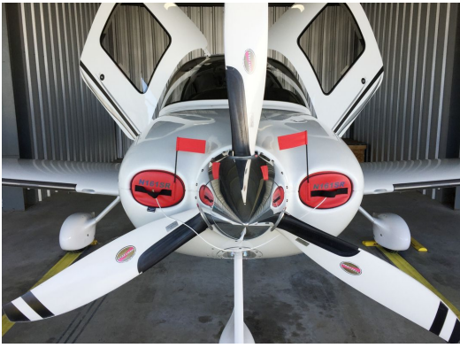
Cirrus SR22 Engine Inlet Plugs