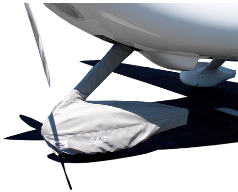
Cirrus Front Wheelpant/Strut Cover