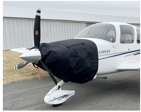
Cirrus SR-20 Insulated Engine Cover