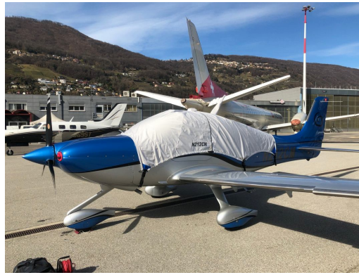
Cirrus SR-22 Canopy Cover (extends to cover parachute panel), Engine Plugs