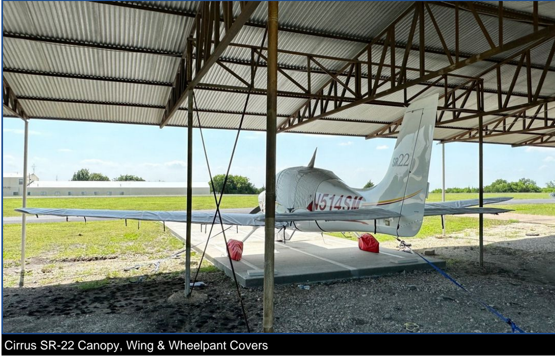
Cirrus SR-22 Canopy, Wing & Wheel pants Covers