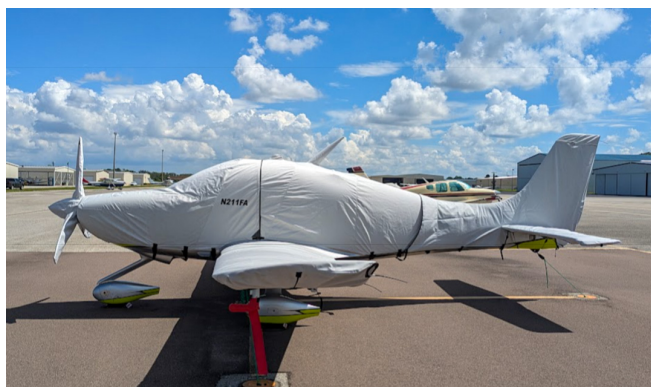
Cirrus SR-20 Complete Cover Set