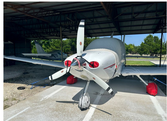
Cirrus SR-22 Wheelpant Covers