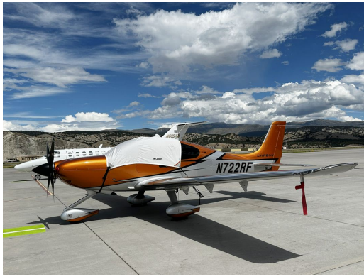
Cirrus SR22 Cockpit Cover, Windshield And Forward Side Windows