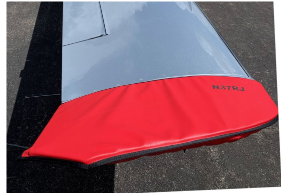
Cirrus SR-22 Wingtip Pads