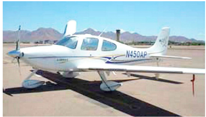
Cirrus SR20 HeatShield set