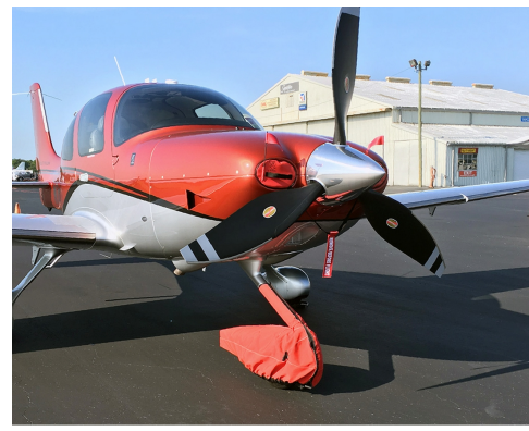
Cirrus SR22 Front Wheelpant/Strut Cover