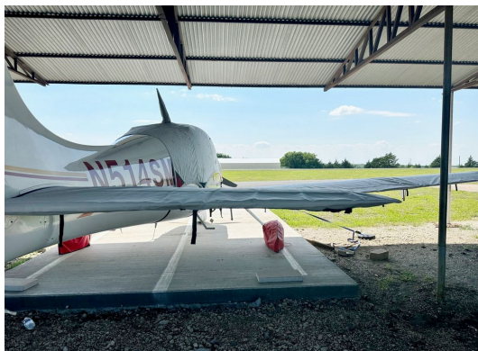
Cirrus SR-22 Canopy, Wing & Wheelpant Covers