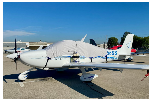
Cirrus SR20 Canopy Cover