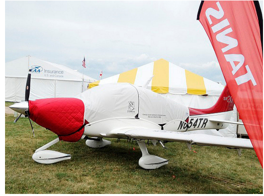
Cirrus SR22 Canopy Cover / Insulated Engine Cover / Wing Covers