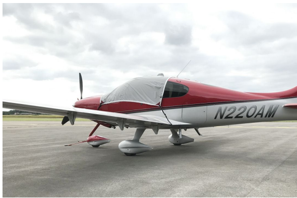
Cirrus SR-22 Cockpit Cover