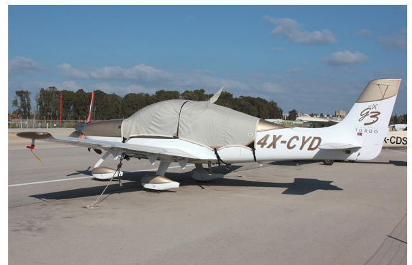
Cirrus SR-22 Canopy Cover