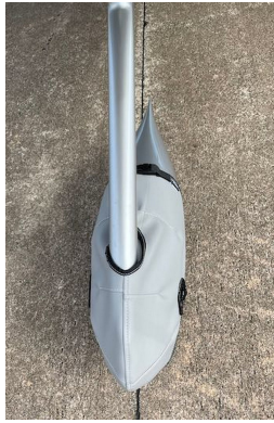
Cirrus Design Corp SR22T ABBREVIATED FRONT WHEELPANT (for tow bar protection)

the horizontal stabilizers with adjustable straps. Tailcone Covers are normally made with Solution-Dyed Polyester or Acrylic Sunbrella .