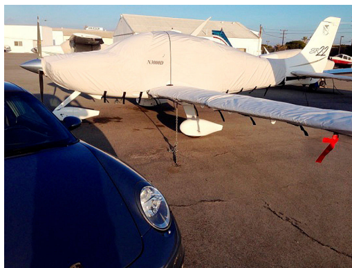
Cirrus SR22 Extended Canopy Engine Cover (extended to tail), Wing Covers