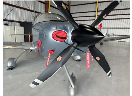
Cirrus SR22 Side Cowl NACA plugs