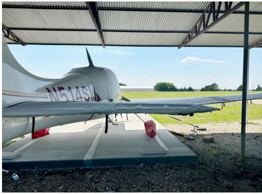
Cirrus SR-22 Canopy, Wing & Wheelpant Covers