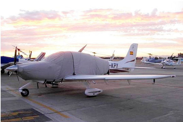
Cirrus SR20 Extended Canopy/Engine Cover