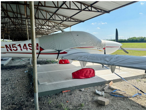
Cirrus SR-22 Canopy, Wing & Wheelpan Cover

WINTER USE MATERIAL - Made with Solution-Dyed Polyester fabric, this option is intended for seasonal use to aid in deicing, rain mitigation, or for occasional travel. The material is lighter and more compact, but more susceptible to UV damage and may have a shorter useful life if used continuously outside than the all-year use material.