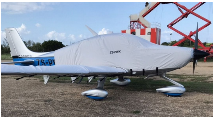
Cirrus SR-22 Extended Canopy/Engine & Wing Covers

WINTER USE MATERIAL - Made with Solution-Dyed Polyester fabric, this option is intended for seasonal use to aid in deicing, rain mitigation, or for occasional travel. The material is lighter and more compact, but more susceptible to UV damage and may have a shorter useful life if used continuously outside than the all-year use material.