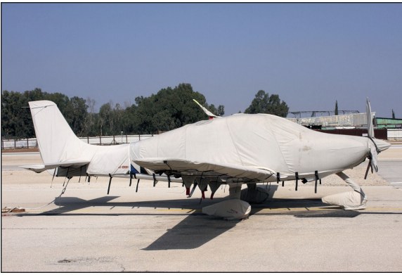
Cirrus SR-22 Full Cover Set