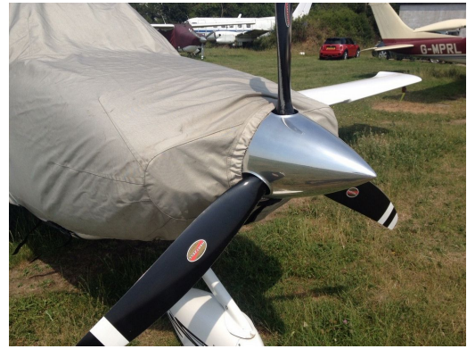
Cirrus SR-20 GTS Extended Canopy/Engine Cover