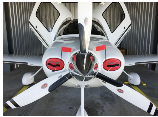
Cirrus SR22 Engine Inlet Plugs