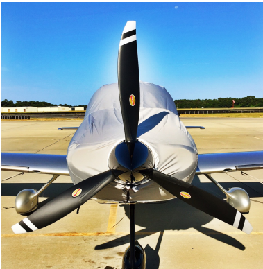
Cirrus SR22 Light Weight Travel Canopy/Engine Cover