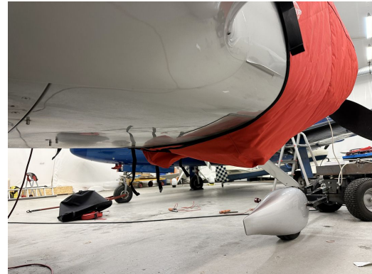
Cirrus SR-22 Insulated Engine Cover