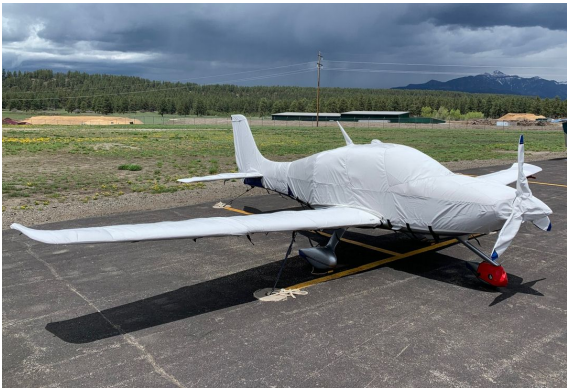
Cirrus SR22 Complete Cover Set