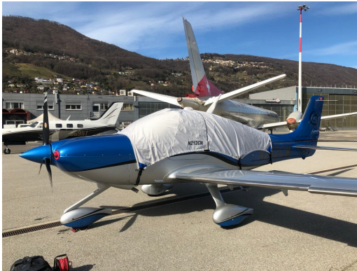
Cirrus SR-22 Canopy Cover (extends to cover parachute panel), Engine Plugs

Engine Inlet Plugs are custom fit for your Cirrus SR22 intakes, made with heavy-duty vinyl material, and stuffed with a single block of sculpted urethane foam. Each plug has a zipper that allows the foam to be removed and dried if necessary. Engine plugs have warning flags that are visible from the cockpit or 'remove before flight' streamers sewn onto the face of the plugs. Most plugs are imprinted with the aircraft registration number in black for an extra charge. Storage bag NOT included. Engine plugs may be inserted after flight when the engine is still warm. Engine Inlet Plugs are commonly referred to as Cowl Plugs, Intake Plugs, Cowl Blocks, Engine Blocks, and Engine Bunges.