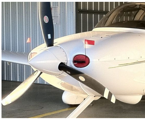
Cirrus SR-22 Engine Inlet Plugs