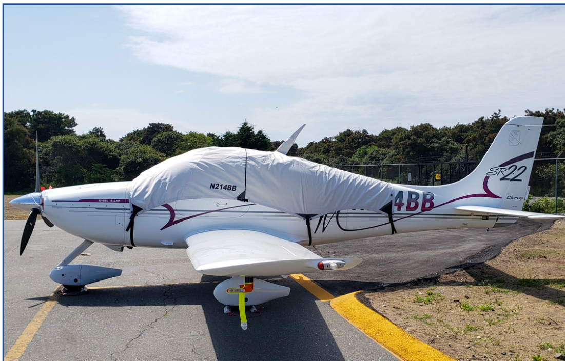
Cirrus SR22 Canopy Cover (Extended to Cover Parachute Panel)