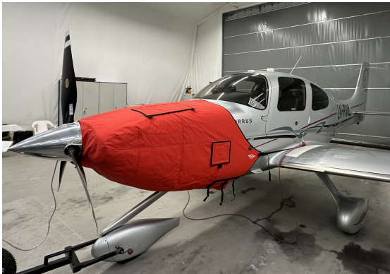
Cirrus SR-22 Insulated Engine Cover