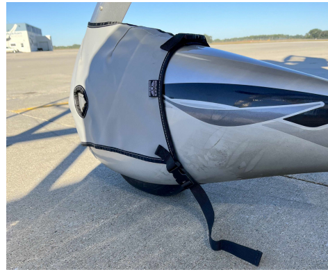
Cirrus SR22 Abbreviated Front Wheelpant (For Tow Bar Protection)