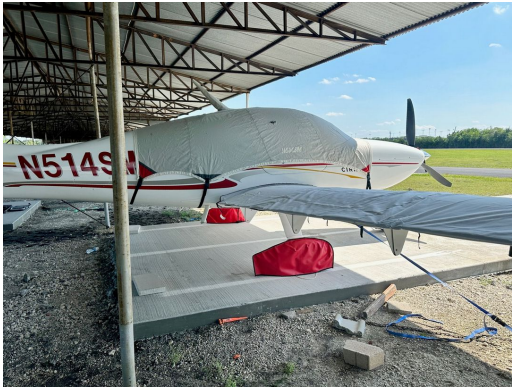
Cirrus SR-22 Canopy, Wing & Wheelpant Covers

Designed to prevent damage to the aircraft extremities in crowded hangars, these products are made of bright red Naugahyde and thickly padded with a sandwich of closed cell foam.