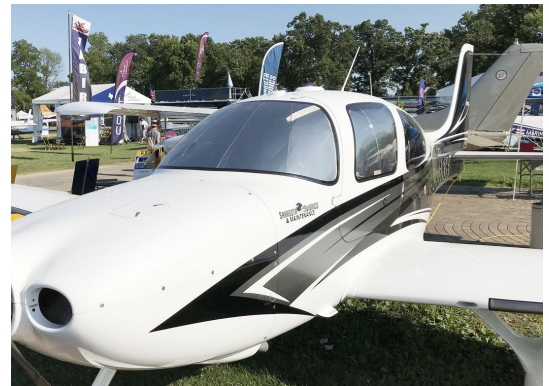
Cirrus SR-22 Cockpit HeatShields