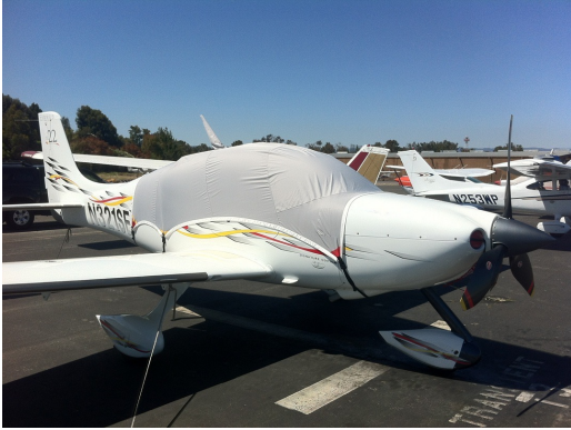
Cirrus Light Weight Travel Canopy Cover

Travel Covers are made with Silver Solution-Dyed Polyester fabric and only lined over the windshield to save weight. The material is lightweight and more compact for easy stowage in the aircraft. The polyester material is water resistant, but only intended for occasional use outside. We also have an ultra lightweight material available for fitted hangar dust covers. For daily outdoor use, the non-travel Sunbrella Cover is the best choice.