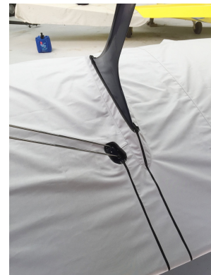
Beech Staggerwing Complete Cover Set, Lower Wing Detail