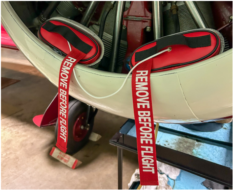
Beech Staggerwing Carb Inlet Plugs, Located Inside Engine