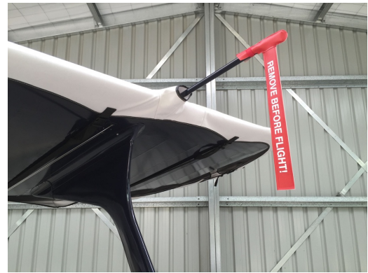
Beech Staggerwing Complete Cover Set, Upper Wing Detail