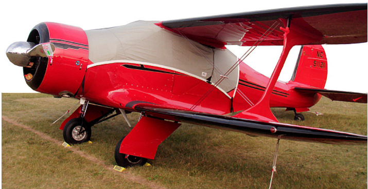
Beech Staggerwing Canopy Cover

This cover type is made from Silver Acrylic Sunbrella canvas and is 100% lined with a soft and smooth microfiber. Bruce's Custom Covers developed this material combination especially for aircraft protection. The outer material is medium weight and treated for water resistance, UV resistance and anti-static buildup. The inner lining is a very soft and smooth microfiber to prevent scratching. The material is very reflective, and tests show that the cabin interior temperature can be reduced to near-ambient temperature on the hottest of days. It is water, ice and snow repellent, yet breathable to allow moisture to escape from between the cover and the aircraft surface.