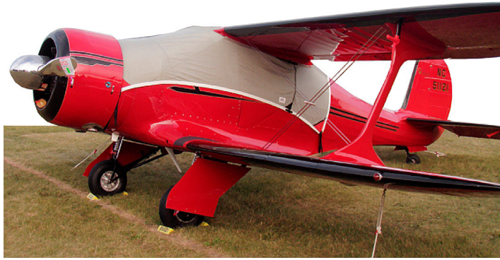
Beech Staggerwing Canopy Cover