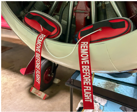
Beech Staggerwing Carb Inlet Plugs, Located Inside Engine

Engine Inlet Plugs are custom fit for your Beech Staggerwing intakes, made with heavy-duty vinyl material, and stuffed with a single block of sculpted urethane foam. Each plug has a zipper that allows the foam to be removed and dried if necessary. Engine plugs have warning flags that are visible from the cockpit or 'remove before flight' streamers sewn onto the face of the plugs. Most plugs are imprinted with the aircraft registration number in black for an extra charge. Storage bag NOT included. Engine plugs may be inserted after flight when the engine is still warm. Engine Inlet Plugs are commonly referred to as Cowl Plugs, Intake Plugs, Cowl Blocks, Engine Blocks, and Engine Bungs.