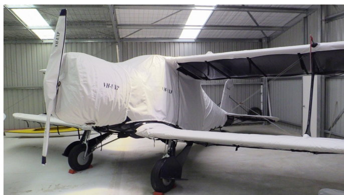
Beech Staggerwing Complete Cover Set

This cover type is made from Silver Acrylic Sunbrella canvas and is 100% lined with a soft and smooth microfiber. Bruce's Custom Covers developed this material combination especially for aircraft protection. The outer material is medium weight and treated for water resistance, UV resistance and anti-static buildup. The inner lining is a very soft and smooth microfiber to prevent scratching. The material is very reflective, and tests show that the cabin interior temperature can be reduced to near-ambient temperature on the hottest of days. It is water, ice and snow repellent, yet breathable to allow moisture to escape from between the cover and the aircraft surface.