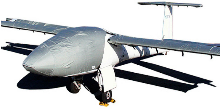
Stemme S-10 Wing Covers & Horiz. Stab. Covers