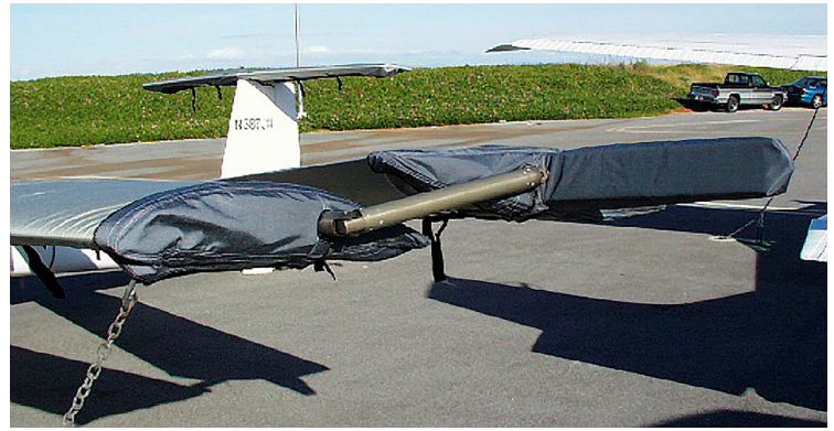
Stemme S-12 Canopy/Nose Cover with Turtledeck Extension, 3D model