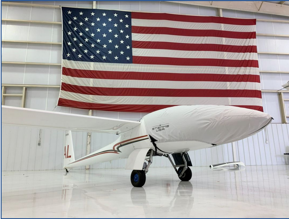
Stemme S-12 Canopy/Nose Cover