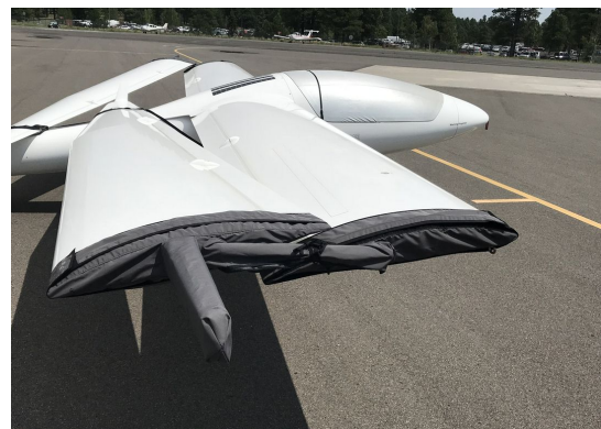
STEMME S10-VT WING FOLD COVERS