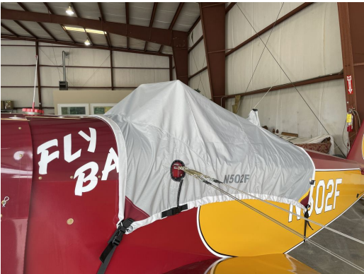
Bowers Fly Baby Canopy Cover