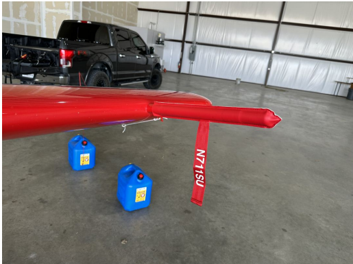
Sukhoi SU-26 Pitot Cover