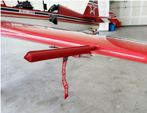
Sukhoi SU-26 Pitot Cover

Sukhoi SU-26 Pitot Tube Covers , NOT HEAT RESISTANT TYPE, are made of Naugahyde vinyl, and are designed to cover the entire pitot assembly. Slipping over the tube, the cover tightens around the base with a Velcro strap detail. A "Remove Before Flight" streamer is attached to the cover. Heat Resistant Pitot Covers are an upgrade to this design, and help prevent the pitot cover from melting onto the tube if the pitot heat is accidentally turned on while installed. If you want the set tethered together, please let us know.