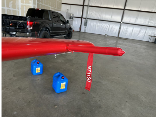
Sukhoi SU-26 Pitot Cover

Sukhoi SU-26 Pitot Tube Covers , NOT HEAT RESISTANT TYPE, are made of Naugahyde vinyl, and are designed to cover the entire pitot assembly. Slipping over the tube, the cover tightens around the base with a Velcro strap detail. A "Remove Before Flight" streamer is attached to the cover. Heat Resistant Pitot Covers are an upgrade to this design, and help prevent the pitot cover from melting onto the tube if the pitot heat is accidentally turned on while installed. If you want the set tethered together, please let us know.