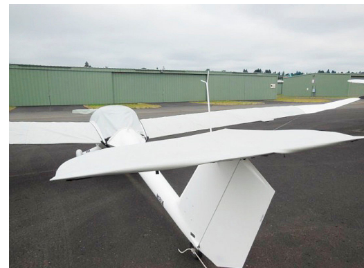
Lambda Canopy/Engine, Wing & Horiz. Stab. Covers