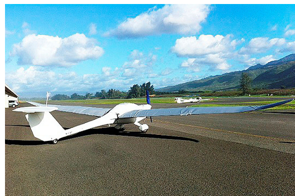
Distar Sundancer LSA Extended Canopy/Engine, Prop, Wheelpants, Wings & Empennage Covers Lambada Canopy/Engine Cover and Wing Covers