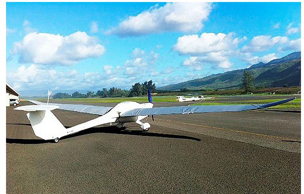
Distar Sundancer LSA Extended Canopy/Engine, Prop, Wheelpants, Wings & Empennage Covers Lambda Canopy/Engine Cover and Wing Covers