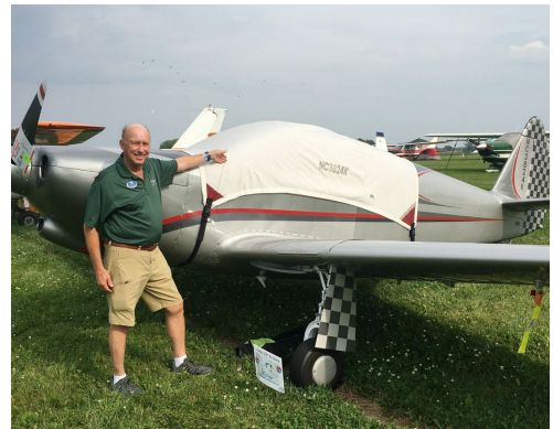
Globe Swift Canopy Cover