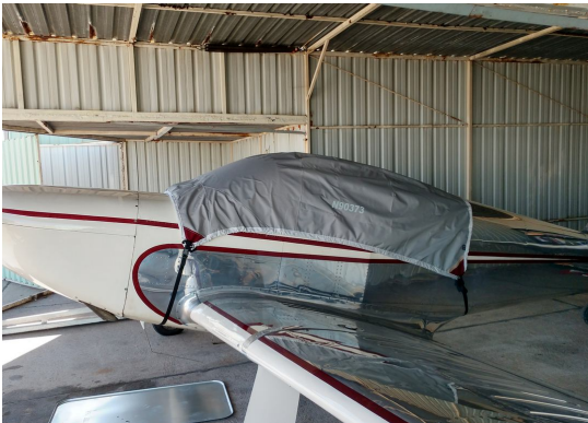
Globe GC-1B Lightweight Travel Cover

Travel Covers are made with Silver Solution-Dyed Polyester fabric and only lined over the windshield to save weight. The material is lightweight and more compact for easy stowage in the aircraft. The polyester material is water resistant, but only intended for occasional use outside. We also have an ultra lightweight material available for fitted hangar dust covers. For daily outdoor use, the non-travel Sunbrella Cover is the best choice.