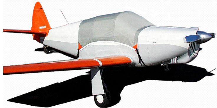
Standard Canopy Cover for Swift