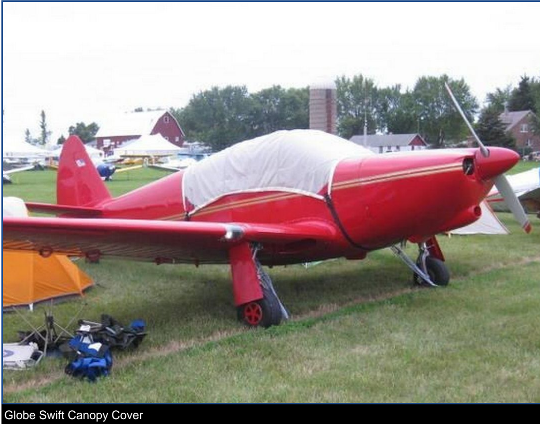
Globe Swift Canopy Cover