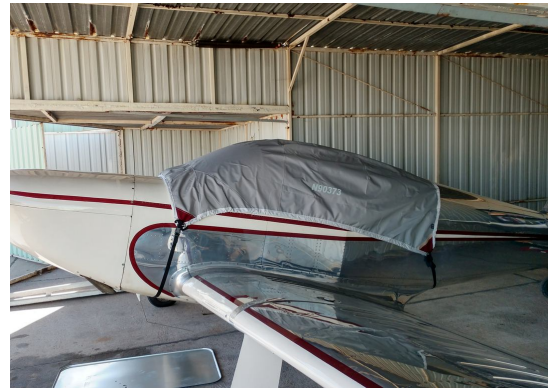
Globe GC-1B Lightweight Travel Cover