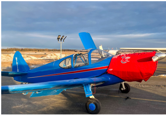
Globe Swift Insulated Engine Cover

This cover type is made from Silver Acrylic Sunbrella canvas and is 100% lined with a soft and smooth microfiber. Bruce's Custom Covers developed this material combination especially for aircraft protection. The outer material is medium weight and treated for water resistance, UV resistance and anti-static buildup. The inner lining is a very soft and smooth microfiber to prevent scratching. The material is very reflective, and tests show that the cabin interior temperature can be reduced to near-ambient temperature on the hottest of days. It is water, ice and snow repellent, yet breathable to allow moisture to escape from between the cover and the aircraft surface.