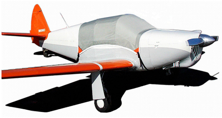
Standard Canopy Cover for Swift