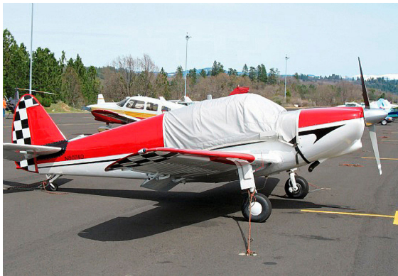
Standard Canopy Cover for Swift

This cover type is made from Silver Acrylic Sunbrella canvas and is 100% lined with a soft and smooth microfiber. Bruce's Custom Covers developed this material combination especially for aircraft protection. The outer material is medium weight and treated for water resistance, UV resistance and anti-static buildup. The inner lining is a very soft and smooth microfiber to prevent scratching. The material is very reflective, and tests show that the cabin interior temperature can be reduced to near-ambient temperature on the hottest of days. It is water, ice and snow repellent, yet breathable to allow moisture to escape from between the cover and the aircraft surface.