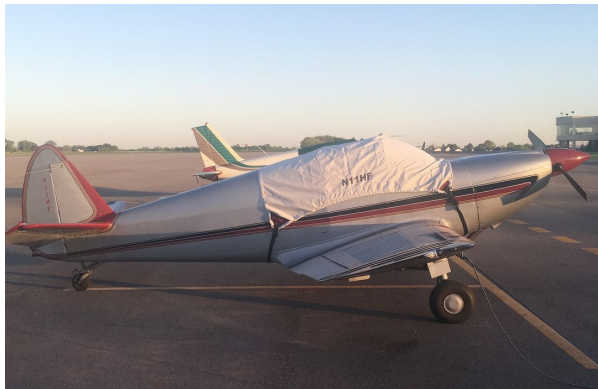
Globe Swift Canopy Cover

This cover type is made from Silver Acrylic Sunbrella canvas and is 100% lined with a soft and smooth microfiber. Bruce's Custom Covers developed this material combination especially for aircraft protection. The outer material is medium weight and treated for water resistance, UV resistance and anti-static buildup. The inner lining is a very soft and smooth microfiber to prevent scratching. The material is very reflective, and tests show that the cabin interior temperature can be reduced to near-ambient temperature on the hottest of days. It is water, ice and snow repellent, yet breathable to allow moisture to escape from between the cover and the aircraft surface.