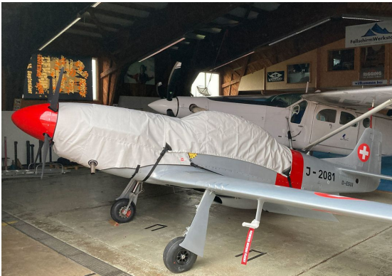
SW-51 Mustang Canopy & Engine Covers

This cover type is made from Silver Acrylic Sunbrella canvas and is 100% lined with a soft and smooth microfiber. Bruce's Custom Covers developed this material combination especially for aircraft protection. The outer material is medium weight and treated for water resistance, UV resistance and anti-static buildup. The inner lining is a very soft and smooth microfiber to prevent scratching. The material is very reflective, and tests show that the cabin interior temperature can be reduced to near-ambient temperature on the hottest of days. It is water, ice and snow repellent, yet breathable to allow moisture to escape from between the cover and the aircraft surface.