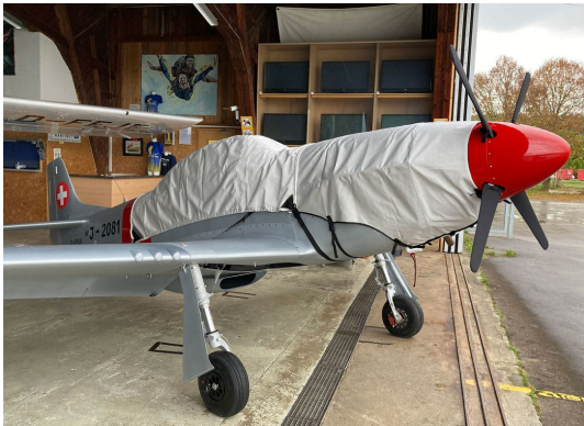
SW-51 Mustang Canopy & Engine Covers