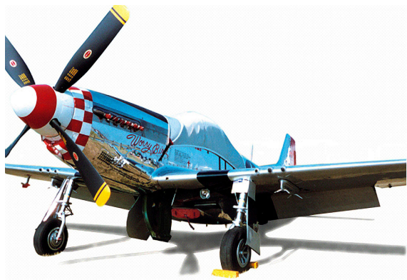
Canopy Cover, Belly & Chin Scoop Plugs

Covers developed this material combination especially for aircraft protection. The outer material is medium weight and treated for water resistance, UV resistance and anti-static buildup. The inner lining is a very soft and smooth microfiber to prevent scratching. The material is very reflective, and tests show that the cabin interior temperature can be reduced to near-ambient temperature on the hottest of days. It is water, ice and snow repellent, yet breathable to allow moisture to escape from between the cover and the aircraft surface.