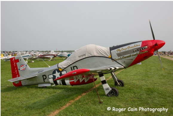
Titan Mustang Canopy Cover