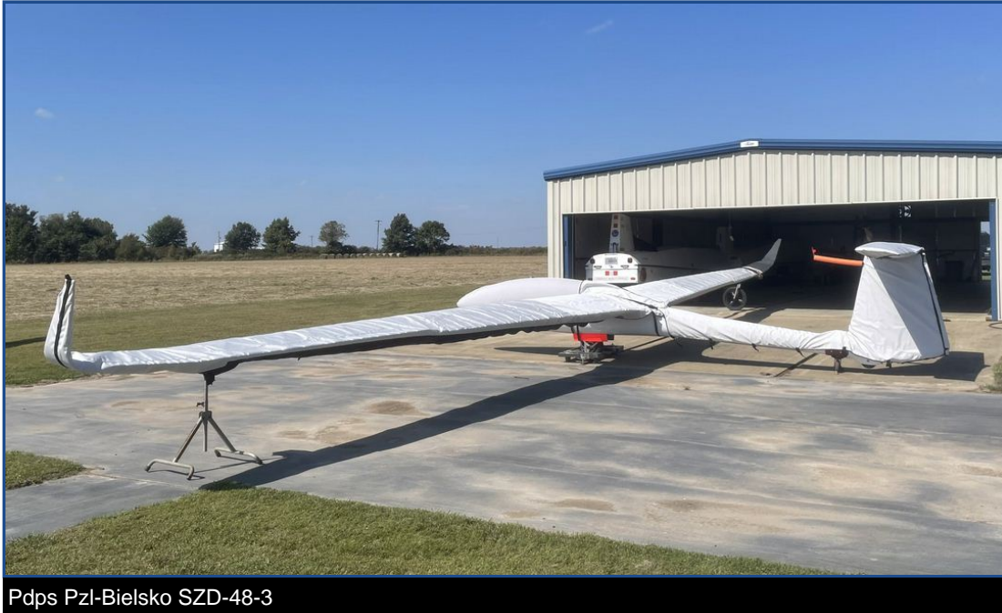
Pdps Pzl-Bielsko SZD-48-3