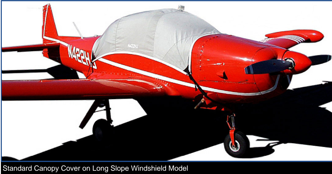
Standard Canopy Cover on Long Slope Windshield Model