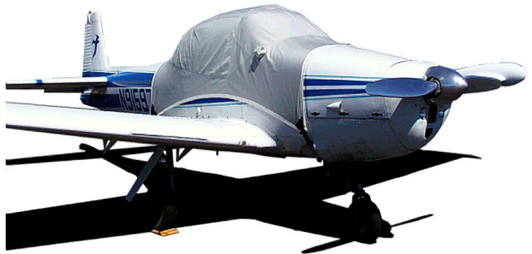
Navion Canopy Cover extends forward to firewall line.