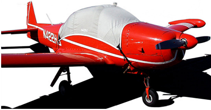
Standard Canopy Cover on Long Slope Windshield Model

Covers developed this material combination especially for aircraft protection. The outer material is medium weight and treated for water resistance, UV resistance and anti-static buildup. The inner lining is a very soft and smooth microfiber to prevent scratching. The material is very reflective, and tests show that the cabin interior temperature can be reduced to near-ambient temperature on the hottest of days. It is water, ice and snow repellent, yet breathable to allow moisture to escape from between the cover and the aircraft surface.