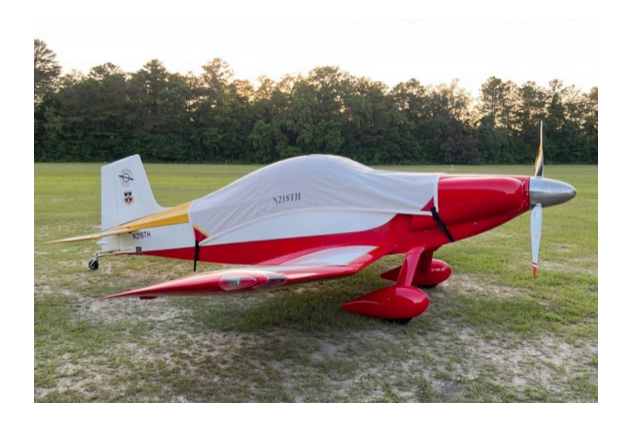
Thorp T-18 Canopy Cover

This cover type is made from Silver Acrylic Sunbrella canvas and is 100% lined with a soft and smooth microfiber. Bruce's Custom Covers developed this material combination especially for aircraft protection. The outer material is medium weight and treated for water resistance, UV resistance and anti-static buildup. The inner lining is a very soft and smooth microfiber to prevent scratching. The material is very reflective, and tests show that the cabin interior temperature can be reduced to near-ambient temperature on the hottest of days. It is water, ice and snow repellent, yet breathable to allow moisture to escape from between the cover and the aircraft surface.