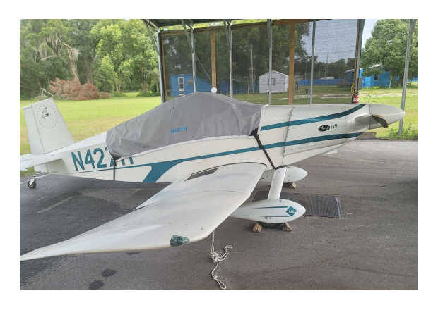
Thorp T-18 Travel Cover