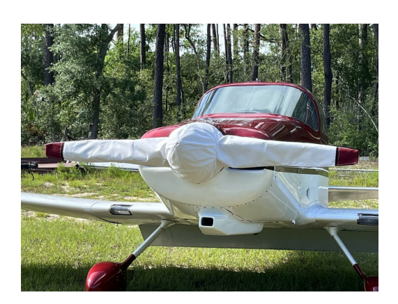
Mustang 2 Prop/Spinner Cover