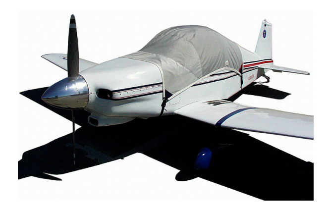
Standard Canopy Cover for Thorp T-18

Travel Covers are made with Silver Solution-Dyed Polyester fabric and only lined over the windshield to save weight. The material is lightweight and more compact for easy stowage in the aircraft. The polyester material is water resistant, but only intended for occasional use outside. We also have an ultra lightweight material available for fitted hangar dust covers. For daily outdoor use, the non-travel Sunbrella Cover is the best choice.