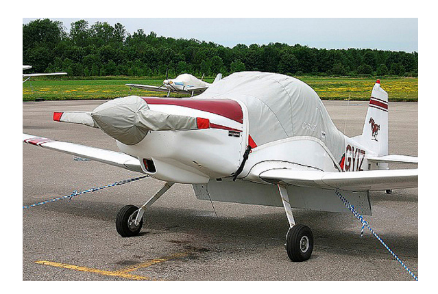
Bushby Mustang Canopy cover and Propellor/Spinner cover

This cover type is made from Silver Acrylic Sunbrella canvas and is 100% lined with a soft and smooth microfiber. Bruce's Custom Covers developed this material combination especially for aircraft protection. The outer material is medium weight and treated for water resistance, UV resistance and anti-static buildup. The inner lining is a very soft and smooth microfiber to prevent scratching. The material is very reflective, and tests show that the cabin interior temperature can be reduced to near-ambient temperature on the hottest of days. It is water, ice and snow repellent, yet breathable to allow moisture to escape from between the cover and the aircraft surface.