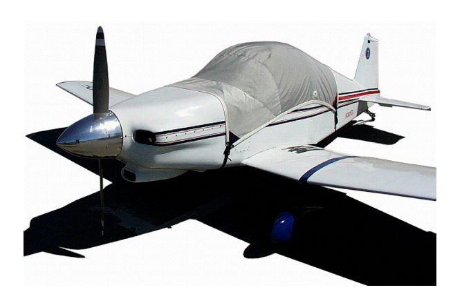
Standard Canopy Cover for Thorp T-18