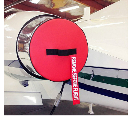
Cessna Citation S2 Exhaust Plugs