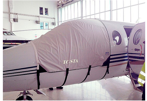
Beechjet 400A Cockpit Cover