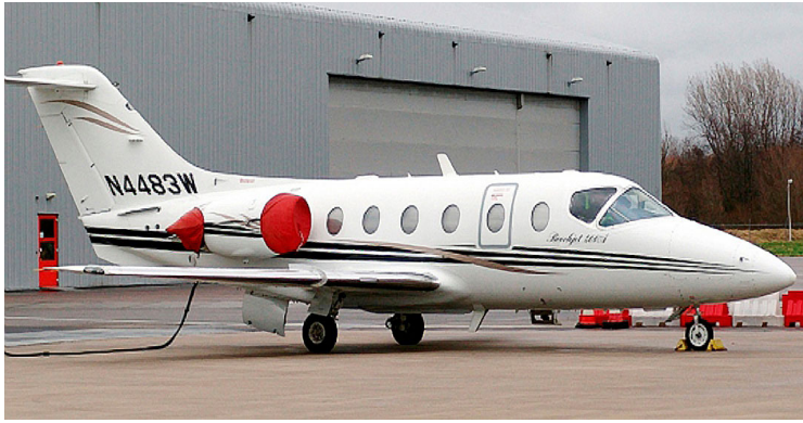
Beechjet 400 Engine Covers

of medium weight nylon which is available in a variety of colors to match the paint trim. Each cover set comes complete with installation and folding instructions. The aircraft's registration number can be silkscreened onto the cover for an extra charge.