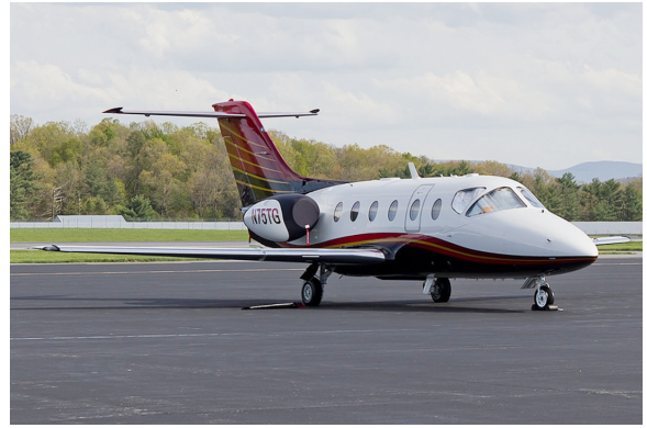
Nextant 400XTi Cockpit HeatShields, Bikini Type Engine Covers