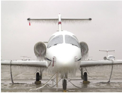
Beechjet 400 Engine Covers

of medium weight nylon which is available in a variety of colors to match the paint trim. Each cover set comes complete with installation and folding instructions. The aircraft's registration number can be silkscreened onto the cover for an extra charge.