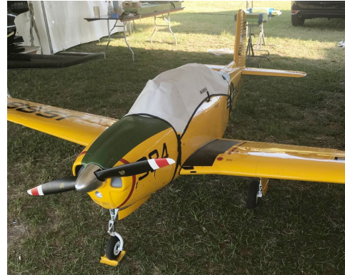
Beechcraft T-34B Mentor Canopy Cover, for 36% Scale Model