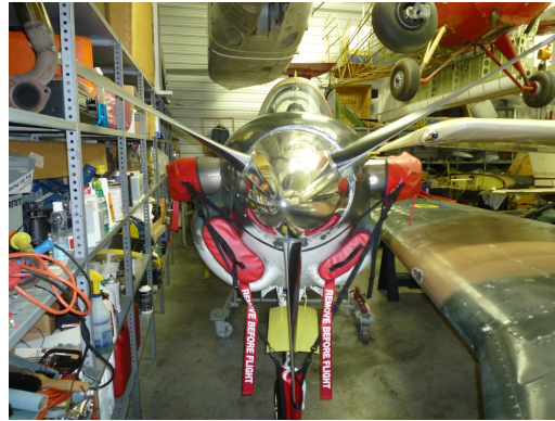
Beech T34C Engine Plugs, Prop Tie/Exhaust Plugs