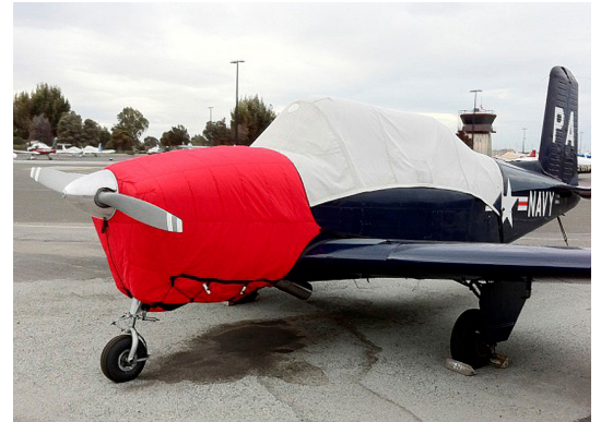
T-34A Insulated Engine Cover