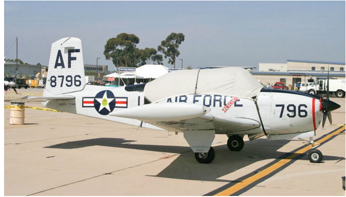
Beech T34 Canopy Cover