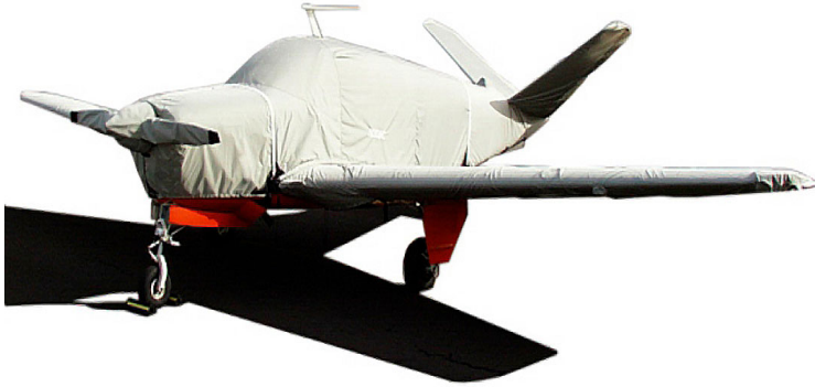
Beech Bonanza Full Cover Set

This cover type is made from Silver Acrylic Sunbrella canvas and is 100% lined with a soft and smooth microfiber. Bruce's Custom Covers developed this material combination especially for aircraft protection. The outer material is medium weight and treated for water resistance, UV resistance and anti-static buildup. The inner lining is a very soft and smooth microfiber to prevent scratching. The material is very reflective, and tests show that the cabin interior temperature can be reduced to near-ambient temperature on the hottest of days. It is water, ice and snow repellent, yet breathable to allow moisture to escape from between the cover and the aircraft surface.