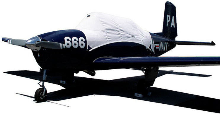
The T34 Canopy Cover

Travel Covers are made with Silver Solution-Dyed Polyester fabric and only lined over the windshield to save weight. The material is lightweight and more compact for easy stowage in the aircraft. The polyester material is water resistant, but only intended for occasional use outside. We also have an ultra lightweight material available for fitted hangar dust covers. For daily outdoor use, the non-travel Sunbrella Cover is the best choice.