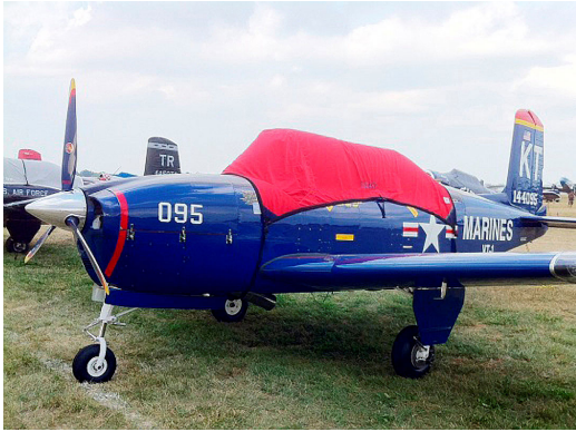
The T34 Canopy Cover

This cover type is made from Silver Acrylic Sunbrella canvas and is 100% lined with a soft and smooth microfiber. Bruce's Custom Covers developed this material combination especially for aircraft protection. The outer material is medium weight and treated for water resistance, UV resistance and anti-static buildup. The inner lining is a very soft and smooth microfiber to prevent scratching. The material is very reflective, and tests show that the cabin interior temperature can be reduced to near-ambient temperature on the hottest of days. It is water, ice and snow repellent, yet breathable to allow moisture to escape from between the cover and the aircraft surface.