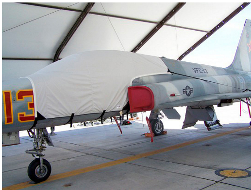
Northup F5 Talon Canopy Cover

This cover type is made from Silver Acrylic Sunbrella canvas and is 100% lined with a soft and smooth microfiber. Bruce's Custom Covers developed this material combination especially for aircraft protection. The outer material is medium weight and treated for water resistance, UV resistance and anti-static buildup. The inner lining is a very soft and smooth microfiber to prevent scratching. The material is very reflective, and tests show that the cabin interior temperature can be reduced to near-ambient temperature on the hottest of days. It is water, ice and snow repellent, yet breathable to allow moisture to escape from between the cover and the aircraft surface.