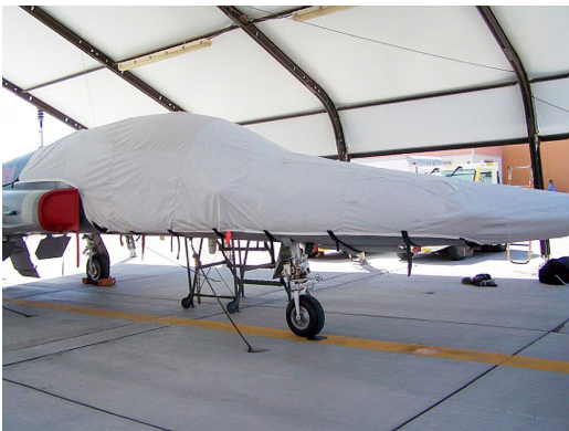
Northup F5 Talon Canopy Cover