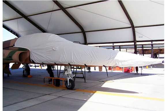
Northrup F-5 Talon Canopy/Nose Cover