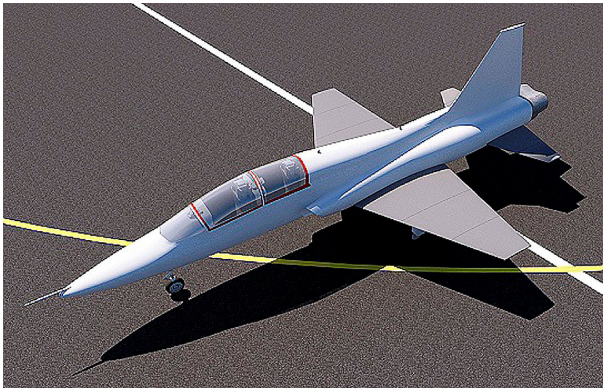
T-38 Talon Wing and Horizontal Stabilizer Covers (3D Rendering)