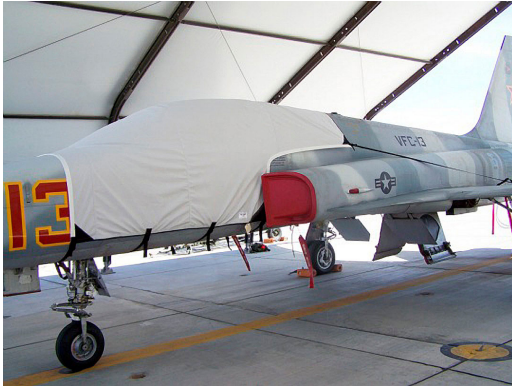
Northrup F5 Talon Canopy Cover

This cover type is made from Silver Acrylic Sunbrella canvas and is 100% lined with a soft and smooth microfiber. Bruce's Custom Covers developed this material combination especially for aircraft protection. The outer material is medium weight and treated for water resistance, UV resistance and anti-static buildup. The inner lining is a very soft and smooth microfiber to prevent scratching. The material is very reflective, and tests show that the cabin interior temperature can be reduced to near-ambient temperature on the hottest of days. It is water, ice and snow repellent, yet breathable to allow moisture to escape from between the cover and the aircraft surface.