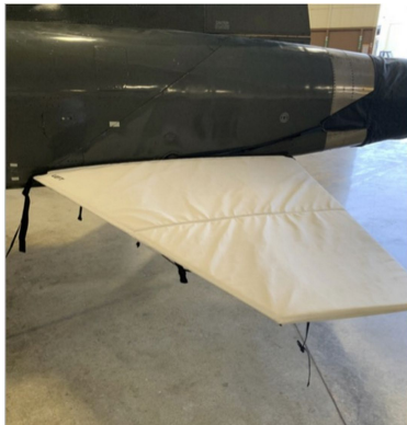
Northrup T-38 Horizontal Stabilizer Covers

WINTER USE MATERIAL - Made with Solution-Dyed Polyester fabric, this option is intended for seasonal use to aid in deicing, rain mitigation, or for occasional travel. The material is lighter and more compact, but more susceptible to UV damage and may have a shorter useful life if used continuously outside than the all-year use material.