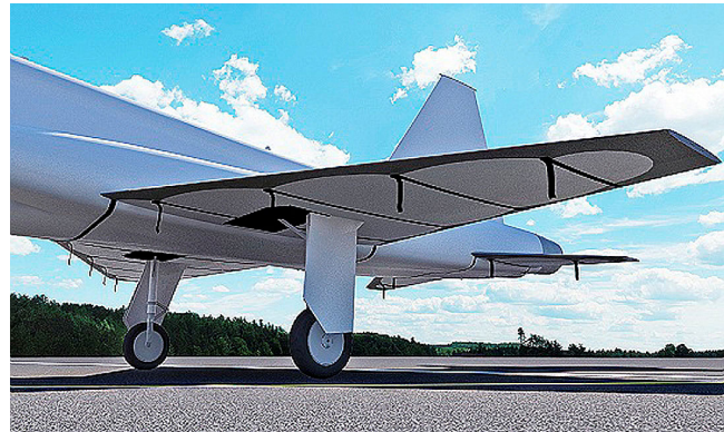
T-38 Talon Wing and Horizontal Stabilizer Covers (3D Rendering)