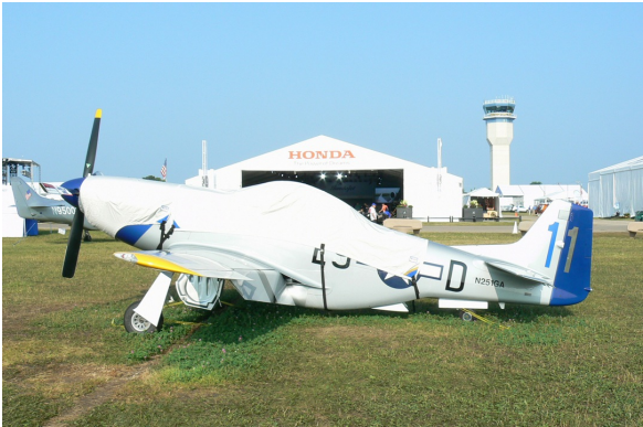
Thunder Mustang Canopy & Engine Cover

This cover type is made from Silver Acrylic Sunbrella canvas and is 100% lined with a soft and smooth microfiber. Bruce's Custom Covers developed this material combination especially for aircraft protection. The outer material is medium weight and treated for water resistance, UV resistance and anti-static buildup. The inner lining is a very soft and smooth microfiber to prevent scratching. The material is very reflective, and tests show that the cabin interior temperature can be reduced to near-ambient temperature on the hottest of days. It is water, ice and snow repellent, yet breathable to allow moisture to escape from between the cover and the aircraft surface.