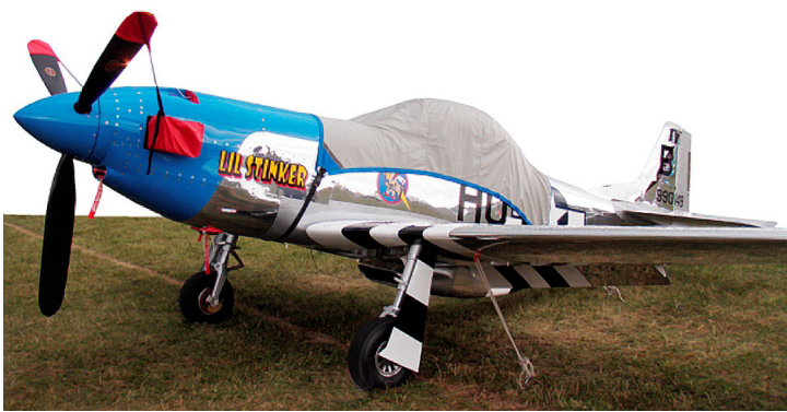
Stewart Mustang Canopy Cover, Prop Tie Downs & Intake Plugs Stewart Mustang Canopy Cover, Prop Tie Downs & Intake Plugs