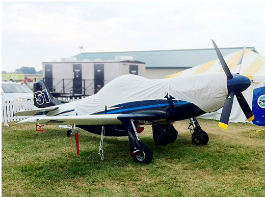
Thunder Mustang Canopy & Engine Cover

This cover type is made from Silver Acrylic Sunbrella canvas and is 100% lined with a soft and smooth microfiber. Bruce's Custom Covers developed this material combination especially for aircraft protection. The outer material is medium weight and treated for water resistance, UV resistance and anti-static buildup. The inner lining is a very soft and smooth microfiber to prevent scratching. The material is very reflective, and tests show that the cabin interior temperature can be reduced to near-ambient temperature on the hottest of days. It is water, ice and snow repellent, yet breathable to allow moisture to escape from between the cover and the aircraft surface.