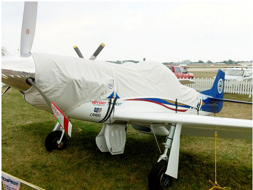
Thunder Mustang Canopy & Engine Cover