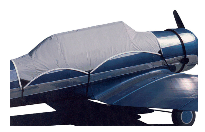
North American T6 Canopy Cover with 30" fwd ext (multi piece back glass), Engine & Prop Covers