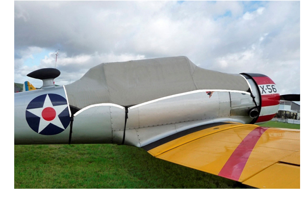
North American T6 Canopy Cover w/50" Forward Extension