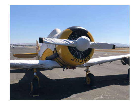
North American Harvard T6 Canopy, Prop & Wing Covers