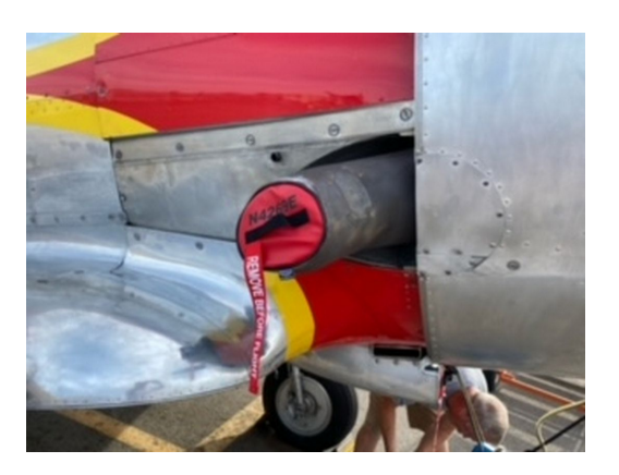
North American T6 Chin Exhaust Plug