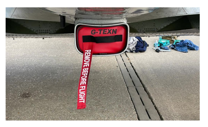
T6 Harvard Chin Scoop Plug

Engine Inlet Plugs are custom fit for your North American T6, SNJ, Harvard intakes, made with heavy-duty vinyl material, and stuffed with a single block of sculpted urethane foam. Each plug has a zipper that allows the foam to be removed and dried if necessary. Engine plugs have warning flags that are visible from the cockpit or 'remove before flight' streamers sewn onto the face of the plugs. Most plugs are imprinted with the aircraft registration number in black for an extra charge. Storage bag NOT included. Engine plugs may be inserted after flight when the engine is still warm. Engine Inlet Plugs are commonly referred to as Cowl Plugs, Intake Plugs, Cowl Blocks, Engine Blocks, and Engine Bungs.