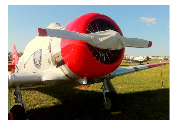
T6 Propellor Cover

This cover type is made from Silver Acrylic Sunbrella canvas and is 100% lined with a soft and smooth microfiber. Bruce's Custom Covers developed this material combination especially for aircraft protection. The outer material is medium weight and treated for water resistance, UV resistance and anti-static buildup. The inner lining is a very soft and smooth microfiber to prevent scratching. The material is very reflective, and tests show that the cabin interior temperature can be reduced to near-ambient temperature on the hottest of days. It is water, ice and snow repellent, yet breathable to allow moisture to escape from between the cover and the aircraft surface.