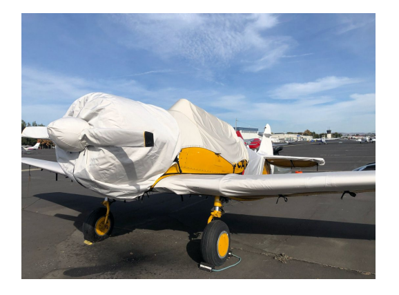
North American T6 Prop, Engine & Wing Covers

WINTER USE MATERIAL - Made with Solution-Dyed Polyester fabric, this option is intended for seasonal use to aid in deicing, rain mitigation, or for occasional travel. The material is lighter and more compact, but more susceptible to UV damage and may have a shorter useful life if used continuously outside than the all-year use material.