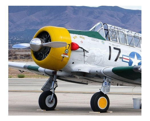
North American T6 Carb Air Scoop Cover