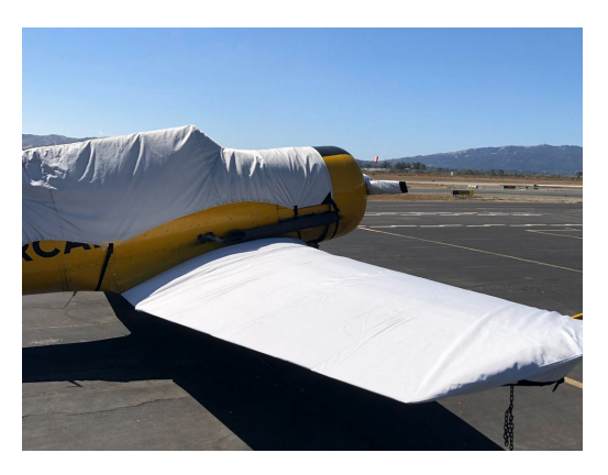
North American Harvard T6 Canopy & Wing Covers