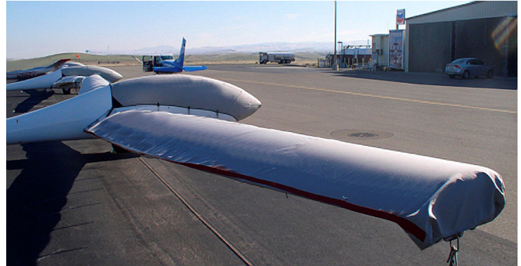
Sailplane Full Cover Set Graphic Indicators (Discus 2B, 3D model)