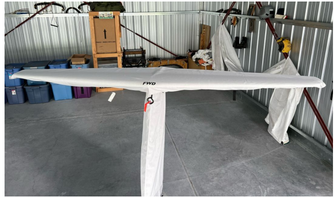
Pipistrel Taurus Complete Cover Set