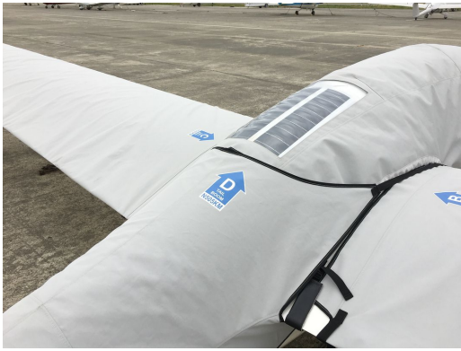
DG-505 Full Cover Set