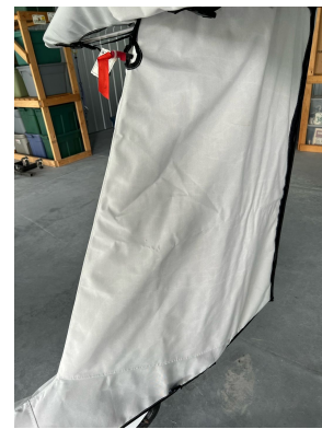
Pipistrel Taurus Complete Cover Set