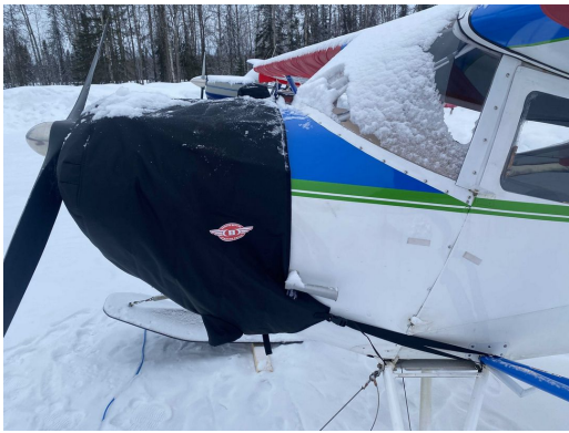
Taylorcraft Insulated Engine Cover

This cover type is made from Silver Acrylic Sunbrella canvas and is 100% lined with a soft and smooth microfiber. Bruce's Custom Covers developed this material combination especially for aircraft protection. The outer material is medium weight and treated for water resistance, UV resistance and anti-static buildup. The inner lining is a very soft and smooth microfiber to prevent scratching. The material is very reflective, and tests show that the cabin interior temperature can be reduced to near-ambient temperature on the hottest of days. It is water, ice and snow repellent, yet breathable to allow moisture to escape from between the cover and the aircraft surface.