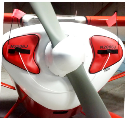
Taylorcraft Engine Inlet Plugs