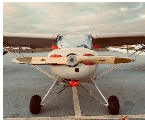
Taylorcraft Engine Inlet Plugs