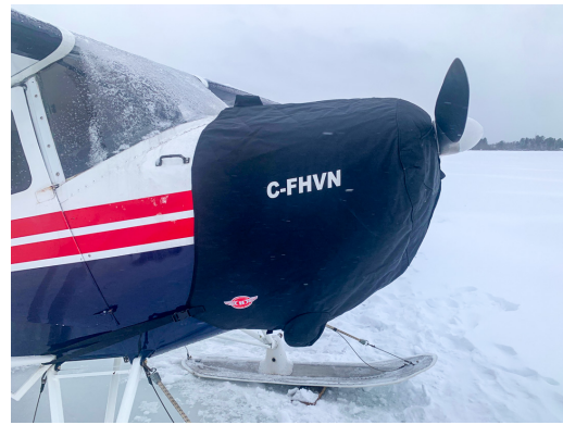
Taylorcraft Models B & F Insulated Engine Cover