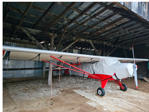
Taylorcraft L-2 Grasshopper Prop, Engine, Canopy, Wing and Empennage Covers Taylorcraft BC12-D Wing Covers, All Year Use