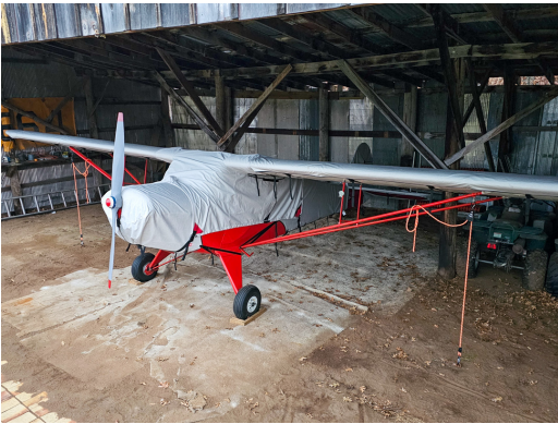
Taylorcraft BC12-D Canopy Cover, Over Top Type

This cover type is made from Silver Acrylic Sunbrella canvas and is 100% lined with a soft and smooth microfiber. Bruce's Custom Covers developed this material combination especially for aircraft protection. The outer material is medium weight and treated for water resistance, UV resistance and anti-static buildup. The inner lining is a very soft and smooth microfiber to prevent scratching. The material is very reflective, and tests show that the cabin interior temperature can be reduced to near-ambient temperature on the hottest of days. It is water, ice and snow repellent, yet breathable to allow moisture to escape from between the cover and the aircraft surface.