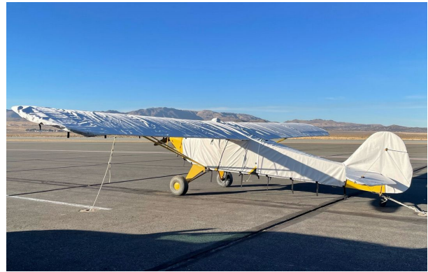
Taylorcraft BC-12D Extended Canopy, Wing & Empennage Covers