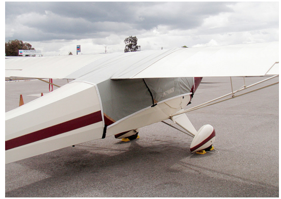
Taylorcraft Over-Top Canopy Cover