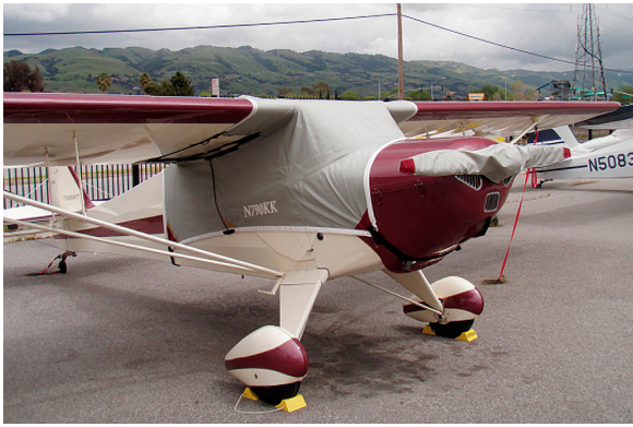
Taylorcraft Over-Top Canopy Cover