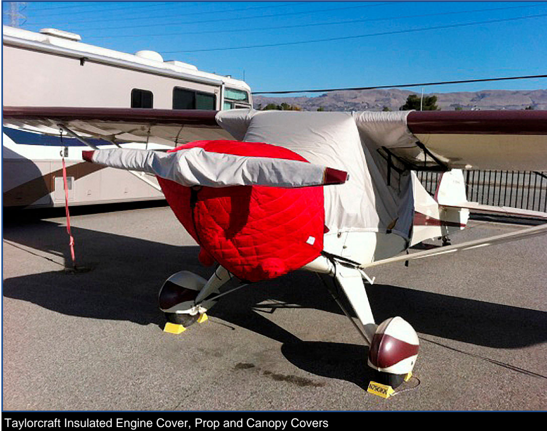
Taylorcraft Insulated Engine Cover, Prop and Canopy Covers