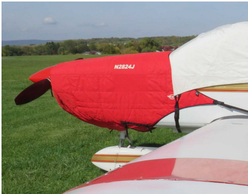
Socata TB10 Insulated Engine Cover