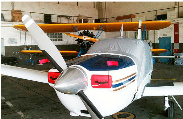
Socata TB20 Canopy Cover and Engine Inlet Plugs

Engine Inlet Plugs are custom fit for your Socata TB9-GT, Tobago: TB10-GT & TB200-GT, Trinidad: TB20-GT, TB21-GT intakes, made with heavy-duty vinyl material, and stuffed with a single block of sculpted urethane foam. Each plug has a zipper that allows the foam to be removed and dried if necessary. Engine plugs have warning flags that are visible from the cockpit or 'remove before flight' streamers sewn onto the face of the plugs. Most plugs are imprinted with the aircraft registration number in black for an extra charge. Storage bag NOT included. Engine plugs may be inserted after flight when the engine is still warm. Engine Inlet Plugs are commonly referred to as Cowl Plugs, Intake Plugs, Cowl Blocks, Engine Blocks, and Engine Bungs.