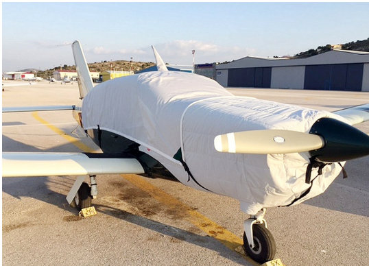
Socata TB-20 Canopy Cover, Insulated Engine Cover

This cover type is made from Silver Acrylic Sunbrella canvas and is 100% lined with a soft and smooth microfiber. Bruce's Custom Covers developed this material combination especially for aircraft protection. The outer material is medium weight and treated for water resistance, UV resistance and anti-static buildup. The inner lining is a very soft and smooth microfiber to prevent scratching. The material is very reflective, and tests show that the cabin interior temperature can be reduced to near-ambient temperature on the hottest of days. It is water, ice and snow repellent, yet breathable to allow moisture to escape from between the cover and the aircraft surface.