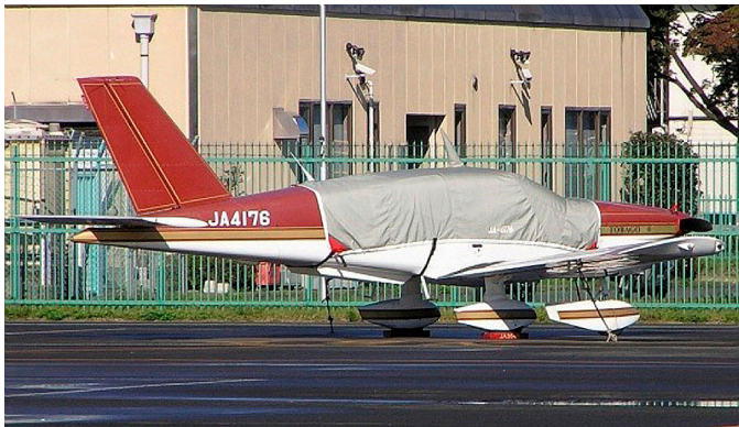
Socata TB-10 Tampico Canopy Cover