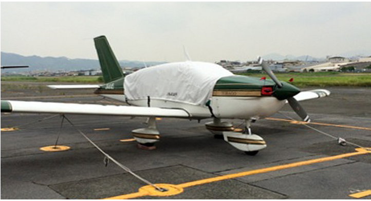
Socata TB-20 Canopy Cover