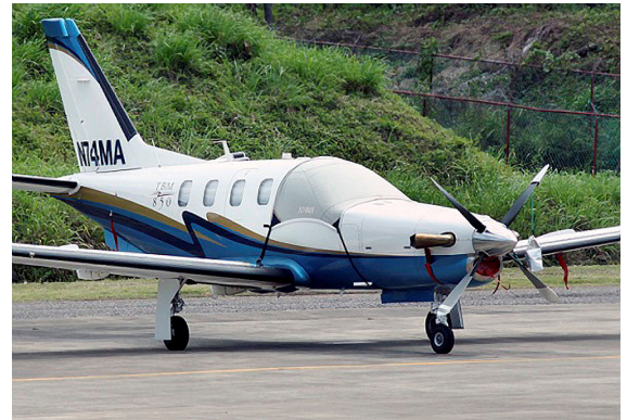
TBM 850 Cockpit Cover