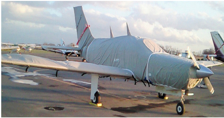
Piper PA-46 Malibu Complete Cover Set

WINTER USE MATERIAL - Made with Solution-Dyed Polyester fabric, this option is intended for seasonal use to aid in deicing, rain mitigation, or for occasional travel. The material is lighter and more compact, but more susceptible to UV damage and may have a shorter useful life if used continuously outside than the all-year use material.