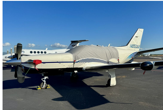
Socata TBM 850 Travel Weight Canopy Cover, Prop Tie/Exhaust Covers