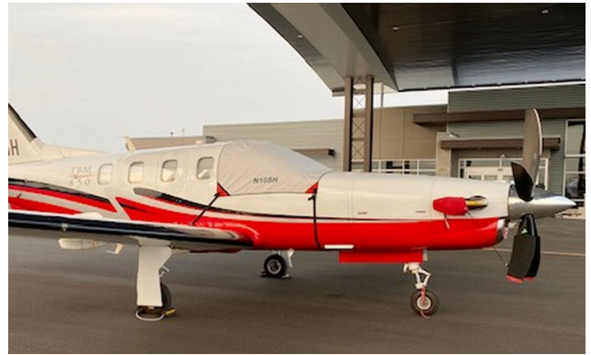
TBM 850 Cockpit Cover (Not Bruce's Prop/Exhaust)