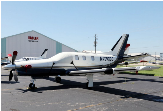
Socata TBM 700 Cockpit Cover, Prop Tie/Exhaust Cover Set

Travel Covers are made with Silver Solution-Dyed Polyester fabric and only lined over the windshield to save weight. The material is lightweight and more compact for easy stowage in the aircraft. The polyester material is water resistant, but only intended for occasional use outside. We also have an ultra lightweight material available for fitted hangar dust covers. For daily outdoor use, the non-travel Sunbrella Cover is the best choice.