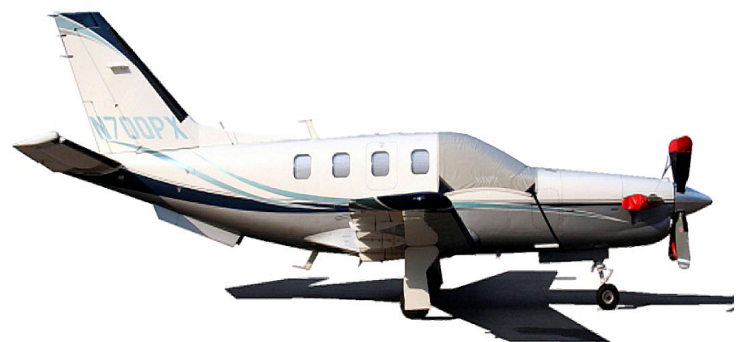
TBM 700 Cockpit Cover & Prop Tie-down/Exhaust Cover Set