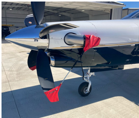
TBM 900 Prop Tie/Exhaust Covers

This cover type is made from Silver Acrylic Sunbrella canvas and is 100% lined with a soft and smooth microfiber. Bruce's Custom Covers developed this material combination especially for aircraft protection. The outer material is medium weight and treated for water resistance, UV resistance and anti-static buildup. The inner lining is a very soft and smooth microfiber to prevent scratching. The material is very reflective, and tests show that the cabin interior temperature can be reduced to near-ambient temperature on the hottest of days. It is water, ice and snow repellent, yet breathable to allow moisture to escape from between the cover and the aircraft surface.