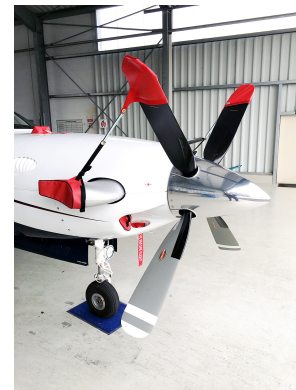
Piper PA-46-500TP PropTie/Exhaust Cover Set