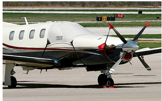
TBM 700 Cockpit Cover, Prop Tie-down/Exhaust Covers, Engine Inlet Plugs & Pitot Cover