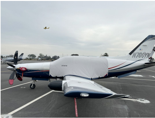
Socata TBM 700 Extended Canopy Cover, Prop Tie/Exhaust Covers

This cover type is made from Silver Acrylic Sunbrella canvas and is 100% lined with a soft and smooth microfiber. Bruce's Custom Covers developed this material combination especially for aircraft protection. The outer material is medium weight and treated for water resistance, UV resistance and anti-static buildup. The inner lining is a very soft and smooth microfiber to prevent scratching. The material is very reflective, and tests show that the cabin interior temperature can be reduced to near-ambient temperature on the hottest of days. It is water, ice and snow repellent, yet breathable to allow moisture to escape from between the cover and the aircraft surface.