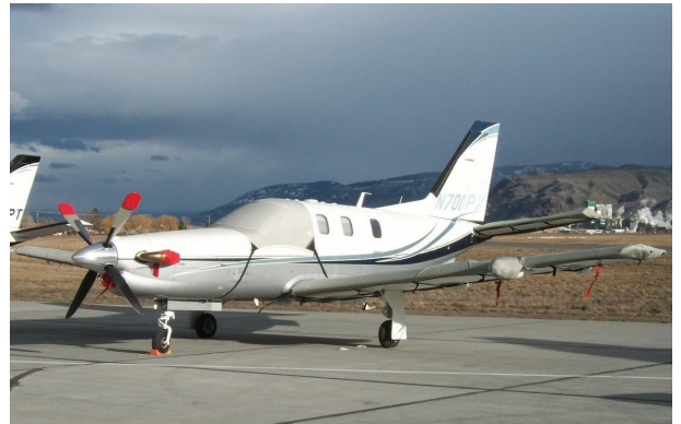
Socata TBM 700 Cockpit, Wing & Horizontal Stab. Covers