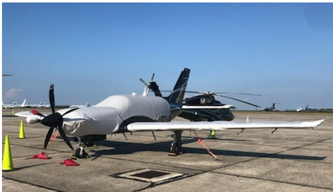
Socata TBM Canopy, Engine, Wing & Horizontal Stabilizer Covers

This cover type is made from Silver Acrylic Sunbrella canvas and is 100% lined with a soft and smooth microfiber. Bruce's Custom Covers developed this material combination especially for aircraft protection. The outer material is medium weight and treated for water resistance, UV resistance and anti-static buildup. The inner lining is a very soft and smooth microfiber to prevent scratching. The material is very reflective, and tests show that the cabin interior temperature can be reduced to near-ambient temperature on the hottest of days. It is water, ice and snow repellent, yet breathable to allow moisture to escape from between the cover and the aircraft surface.