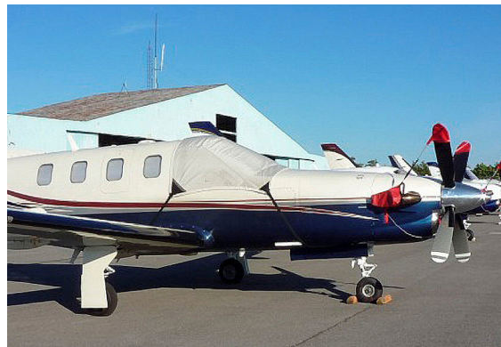
Socata TBM Cockpit Cover, Prop Tie/Exhaust Covers