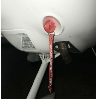
Tecnam P2010 Small Engine Inlet Plug

Engine Inlet Plugs are custom fit for your Tecnam P2008 intakes, made with heavy-duty vinyl material, and stuffed with a single block of sculpted urethane foam. Each plug has a zipper that allows the foam to be removed and dried if necessary. Engine plugs have warning flags that are visible from the cockpit or 'remove before flight' streamers sewn onto the face of the plugs. Most plugs are imprinted with the aircraft registration number in black for an extra charge. Storage bag NOT included. Engine plugs may be inserted after flight when the engine is still warm. Engine Inlet Plugs are commonly referred to as Cowl Plugs, Intake Plugs, Cowl Blocks, Engine Blocks, and Engine Bungs.