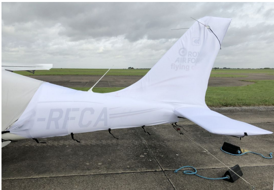
Tecnam P2008 Empennage Cover, test fit cover

WINTER USE MATERIAL - Made with Solution-Dyed Polyester fabric, this option is intended for seasonal use to aid in deicing, rain mitigation, or for occasional travel. The material is lighter and more compact, but more susceptible to UV damage and may have a shorter useful life if used continuously outside than the all-year use material.