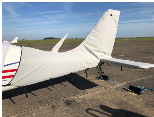
Tecnam Eaglet Empennage Cover (3D model) Tecnam P2008 Empennage Cover (Tailboom, Vertical & Horiz Stabilizers), All Year Use