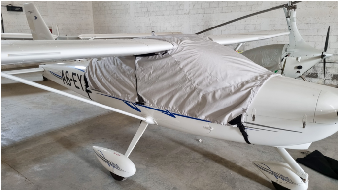
Tecnam P2008 Canopy Cover, over top type

This cover type is made from Silver Acrylic Sunbrella canvas and is 100% lined with a soft and smooth microfiber. Bruce's Custom Covers developed this material combination especially for aircraft protection. The outer material is medium weight and treated for water resistance, UV resistance and anti-static buildup. The inner lining is a very soft and smooth microfiber to prevent scratching. The material is very reflective, and tests show that the cabin interior temperature can be reduced to near-ambient temperature on the hottest of days. It is water, ice and snow repellent, yet breathable to allow moisture to escape from between the cover and the aircraft surface.