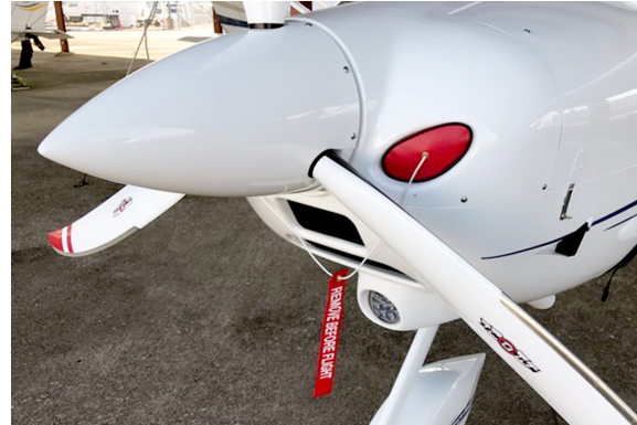
Tecnam P2008 Engine Inlet Plugs