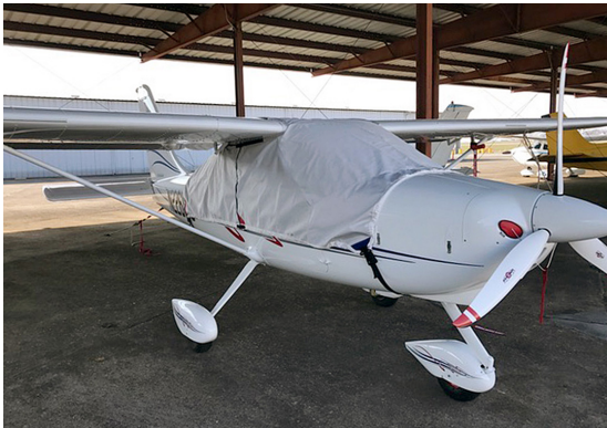
Tecnam P2008 Canopy Cover, Over-Top Type

This cover type is made from Silver Acrylic Sunbrella canvas and is 100% lined with a soft and smooth microfiber. Bruce's Custom Covers developed this material combination especially for aircraft protection. The outer material is medium weight and treated for water resistance, UV resistance and anti-static buildup. The inner lining is a very soft and smooth microfiber to prevent scratching. The material is very reflective, and tests show that the cabin interior temperature can be reduced to near-ambient temperature on the hottest of days. It is water, ice and snow repellent, yet breathable to allow moisture to escape from between the cover and the aircraft surface.