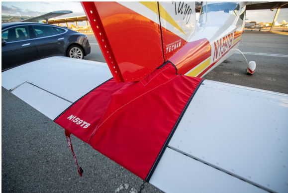
Tecnam Bravo Tailcone Cover

WINTER USE MATERIAL - Made with Solution-Dyed Polyester fabric, this option is intended for seasonal use to aid in deicing, rain mitigation, or for occasional travel. The material is lighter and more compact, but more susceptible to UV damage and may have a shorter useful life if used continuously outside than the all-year use material.