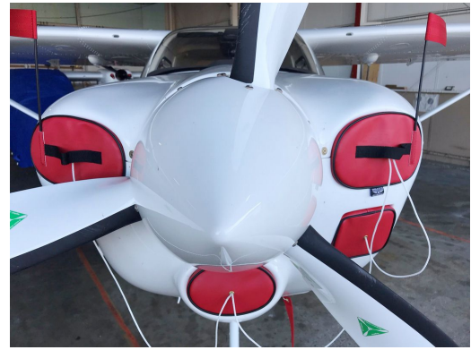
Tecnam Engine Plugs, set of 5