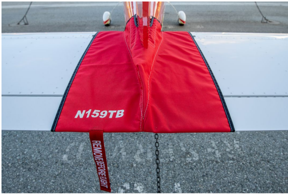
Tecnam Bravo Tailcone Cover

WINTER USE MATERIAL - Made with Solution-Dyed Polyester fabric, this option is intended for seasonal use to aid in deicing, rain mitigation, or for occasional travel. The material is lighter and more compact, but more susceptible to UV damage and may have a shorter useful life if used continuously outside than the all-year use material.