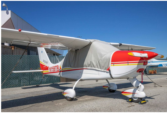
Tecnam P2004 Bravo