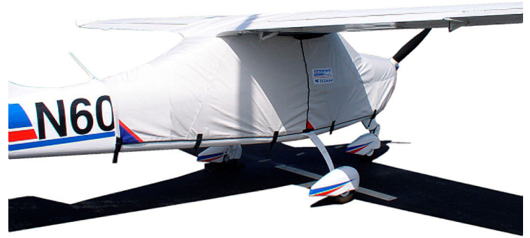
Tecnam Bravo Extended Canopy/Engine Cover