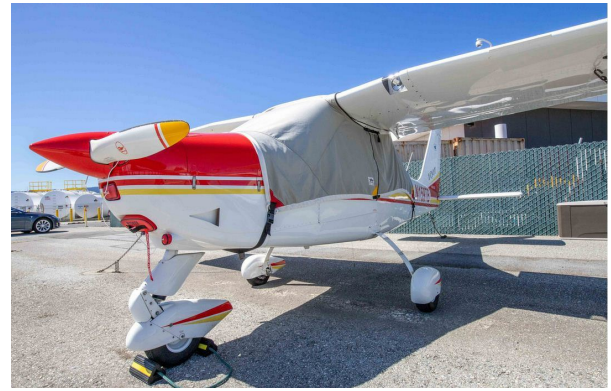
Tecnam P2004 Bravo