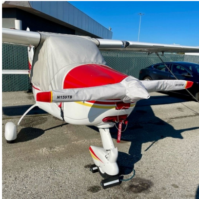
Tecnam Bravo Canopy & Prop Covers, Engine Plugs