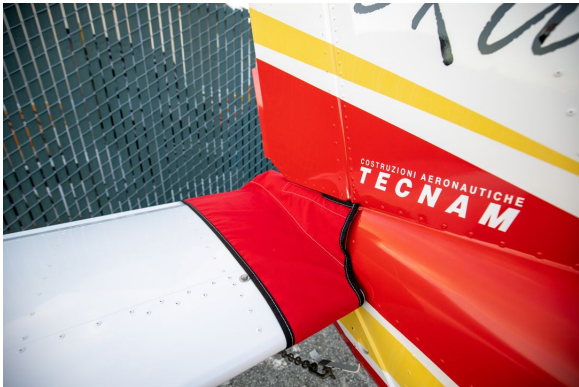
Tecnam Bravo Tailcone Cover