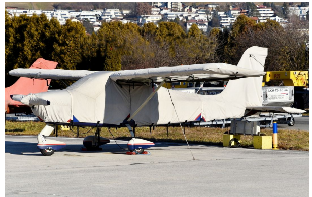
Tecnam P92 Echo Complete Cover Set