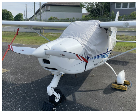
Tecnam P92 EAGLET Canopy Cover Over theTop Style