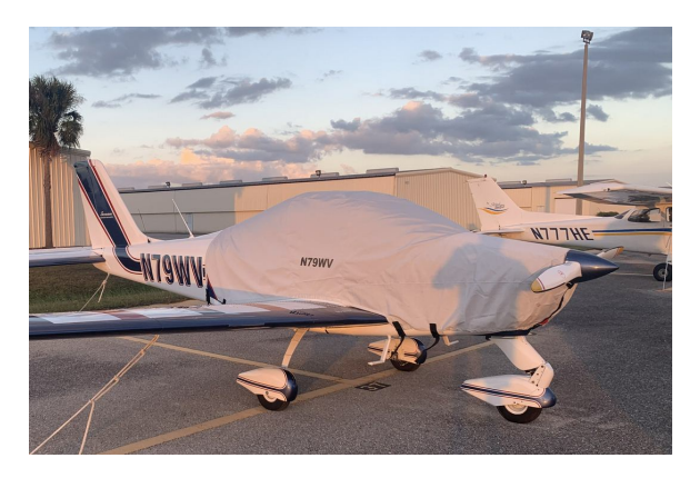
Tecnam Sierra Extended Canopy/Engine Cover