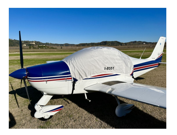
Tecnam P2002 Sierra Canopy Cover

This cover type is made from Silver Acrylic Sunbrella canvas and is 100% lined with a soft and smooth microfiber. Bruce's Custom Covers developed this material combination especially for aircraft protection. The outer material is medium weight and treated for water resistance, UV resistance and anti-static buildup. The inner lining is a very soft and smooth microfiber to prevent scratching. The material is very reflective, and tests show that the cabin interior temperature can be reduced to near-ambient temperature on the hottest of days. It is water, ice and snow repellent, yet breathable to allow moisture to escape from between the cover and the aircraft surface.