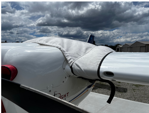
Tecnam P2006T Twin Wing & Engine Covers, All Year Use

WINTER USE MATERIAL - Made with Solution-Dyed Polyester fabric, this option is intended for seasonal use to aid in deicing, rain mitigation, or for occasional travel. The material is lighter and more compact, but more susceptible to UV damage and may have a shorter useful life if used continuously outside than the all-year use material.