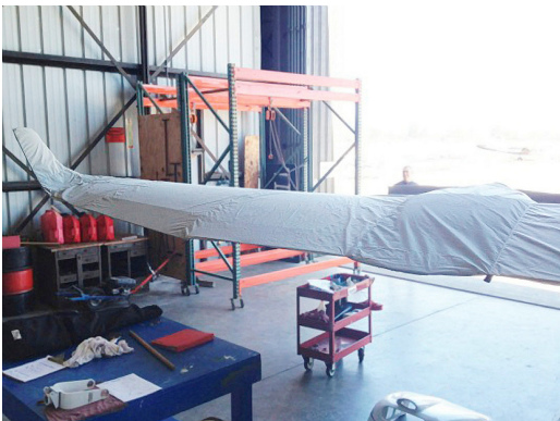
Tecnam Twin Wing/Engine Covers

This cover type is made from Silver Acrylic Sunbrella canvas and is 100% lined with a soft and smooth microfiber. Bruce's Custom Covers developed this material combination especially for aircraft protection. The outer material is medium weight and treated for water resistance, UV resistance and anti-static buildup. The inner lining is a very soft and smooth microfiber to prevent scratching. The material is very reflective, and tests show that the cabin interior temperature can be reduced to near-ambient temperature on the hottest of days. It is water, ice and snow repellent, yet breathable to allow moisture to escape from between the cover and the aircraft surface.