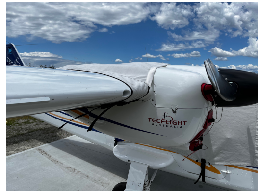
Tecnam P2006T Twin Wing & Engine Covers, All Year Use