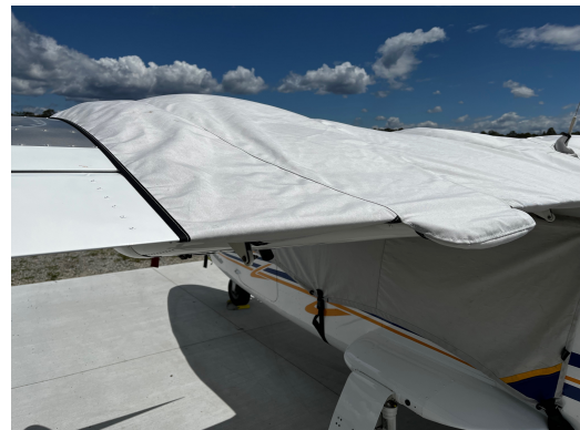
Tecnam P2006T Twin Wing & Engine Covers, All Year Use