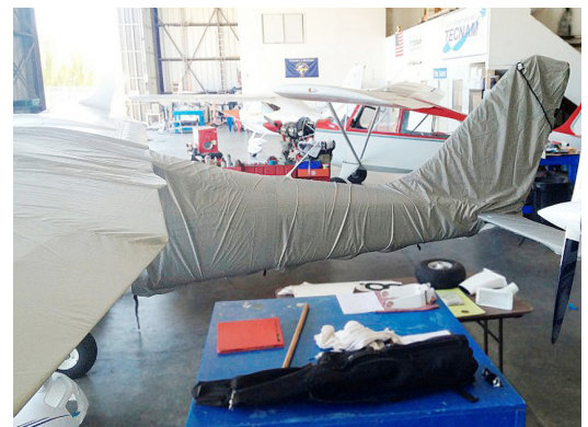
Tecnam Twin Wing & Empennage Covers