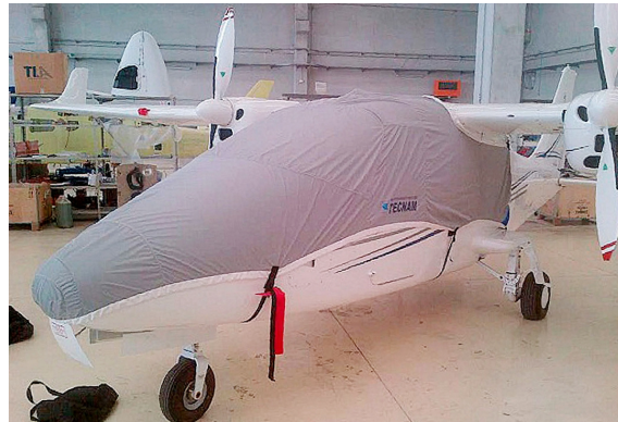
Tecnam P2006T Twin Lightweight Travel Canopy/Nose Cover

Travel Covers are made with Silver Solution-Dyed Polyester fabric and only lined over the windshield to save weight. The material is lightweight and more compact for easy stowage in the aircraft. The polyester material is water resistant, but only intended for occasional use outside. We also have an ultra lightweight material available for fitted hangar dust covers. For daily outdoor use, the non-travel Sunbrella Cover is the best choice.