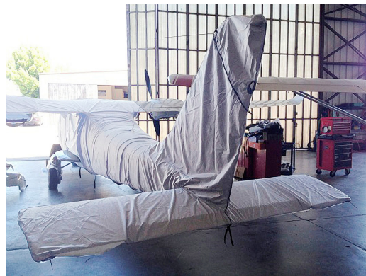
Tecnam Twin Wing & Empennage Covers Tecnam Twin Canopy/Nose, Empennage, Wing/Engine, & Propellor/Spinner Covers