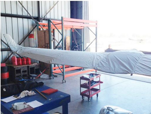
Tecnam Twin Wing/Engine Covers

This cover type is made from Silver Acrylic Sunbrella canvas and is 100% lined with a soft and smooth microfiber. Bruce's Custom Covers developed this material combination especially for aircraft protection. The outer material is medium weight and treated for water resistance, UV resistance and anti-static buildup. The inner lining is a very soft and smooth microfiber to prevent scratching. The material is very reflective, and tests show that the cabin interior temperature can be reduced to near-ambient temperature on the hottest of days. It is water, ice and snow repellent, yet breathable to allow moisture to escape from between the cover and the aircraft surface.