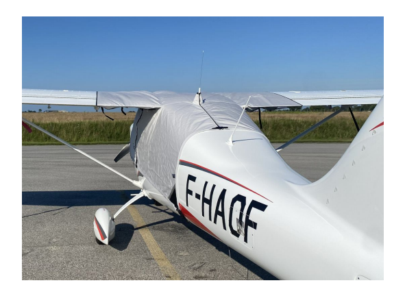
Tecnam P2010 Over-Top Canopy Cover