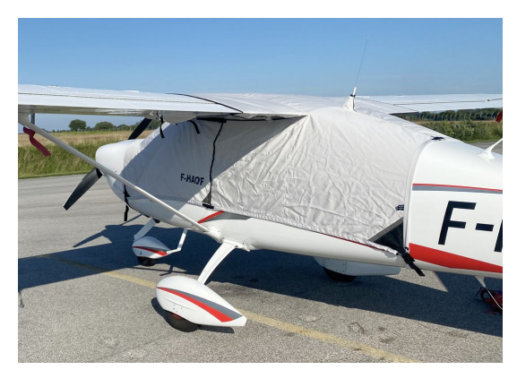
Tecnam P2010 Over-Top Canopy Cover