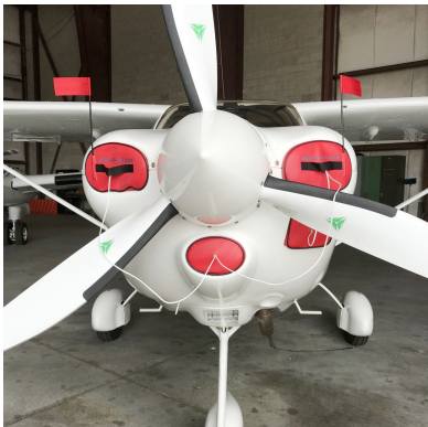
Tecnam P2010 Engine Plugs