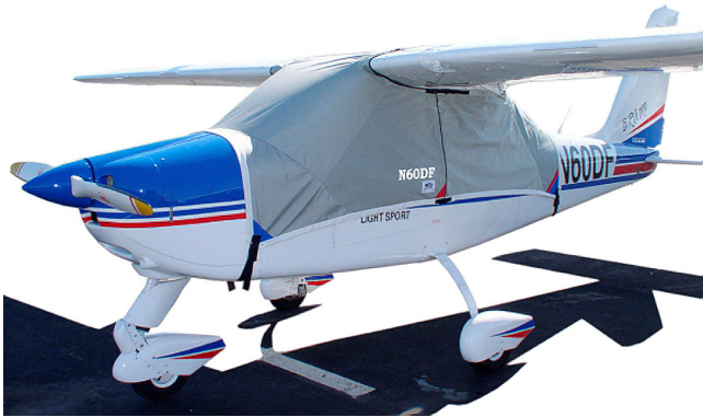
Tecnam Bravo Canopy Cover

The material is very reflective, and tests show that the cabin interior temperature can be reduced to near-ambient temperature on the hottest of days. It is water, ice and snow repellent, yet breathable to allow moisture to escape from between the cover and the aircraft surface.