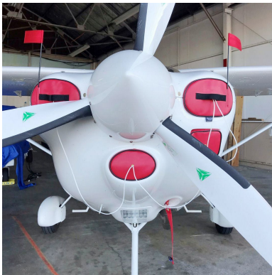
Tecnam Engine Plugs, set of 5

Engine Inlet Plugs are custom fit for your Tecnam P92 Eaglet intakes, made with heavy-duty vinyl material, and stuffed with a single block of sculpted urethane foam. Each plug has a zipper that allows the foam to be removed and dried if necessary. Engine plugs have warning flags that are visible from the cockpit or 'remove before flight' streamers sewn onto the face of the plugs. Most plugs are imprinted with the aircraft registration number in black for an extra charge. Storage bag NOT included. Engine plugs may be inserted after flight when the engine is still warm. Engine Inlet Plugs are commonly referred to as Cowl Plugs, Intake Plugs, Cowl Blocks, Engine Blocks, and Engine Bungs.