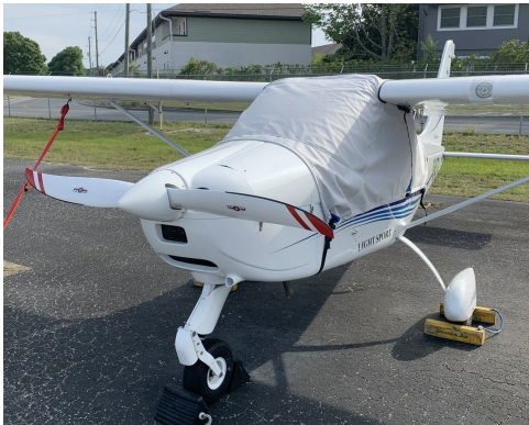
Tecnam P92 EAGLET Canopy Cover Over theTop Style

Travel Covers are made with Silver Solution-Dyed Polyester fabric and only lined over the windshield to save weight. The material is lightweight and more compact for easy stowage in the aircraft. The polyester material is water resistant, but only intended for occasional use outside. We also have an ultra lightweight material available for fitted hangar dust covers. For daily outdoor use, the non-travel Sunbrella Cover is the best choice.