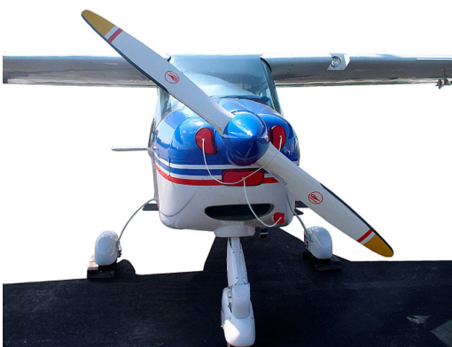
Tecnam Bravo Engine Plugs

Engine Inlet Plugs are custom fit for your Tecnam P92 Eaglet intakes, made with heavy-duty vinyl material, and stuffed with a single block of sculpted urethane foam. Each plug has a zipper that allows the foam to be removed and dried if necessary. Engine plugs have warning flags that are visible from the cockpit or 'remove before flight' streamers sewn onto the face of the plugs. Most plugs are imprinted with the aircraft registration number in black for an extra charge. Storage bag NOT included. Engine plugs may be inserted after flight when the engine is still warm. Engine Inlet Plugs are commonly referred to as Cowl Plugs, Intake Plugs, Cowl Blocks, Engine Blocks, and Engine Bungs.