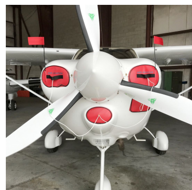
Tecnam P2010 Engine Plugs