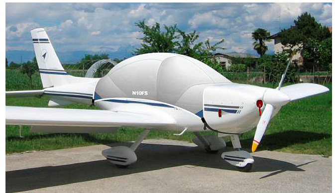
Texan Canopy Cover & Engine Plugs (Illustration)