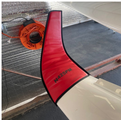
Stemme S-10 & S-12 Wingtip Pads

Designed to prevent damage to the wingtip in crowded hangars or high traffic areas, these products are made of bright red Naugahyde and thickly padded with a sandwich of closed cell foam. Protects delicate winglets, casters and their housings, and soft finishes.