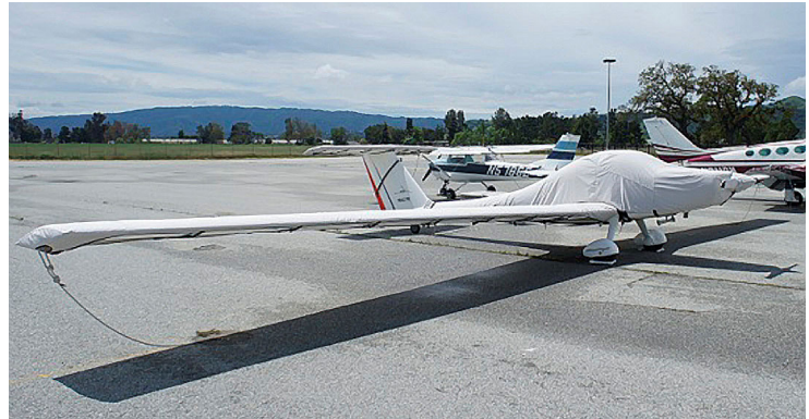
Lambda Canopy/Engine Cover and Wing Covers Grob 109 Canopy/Engine w/ extension to tail, Wing, Stabilizer & Prop/Spinner Covers