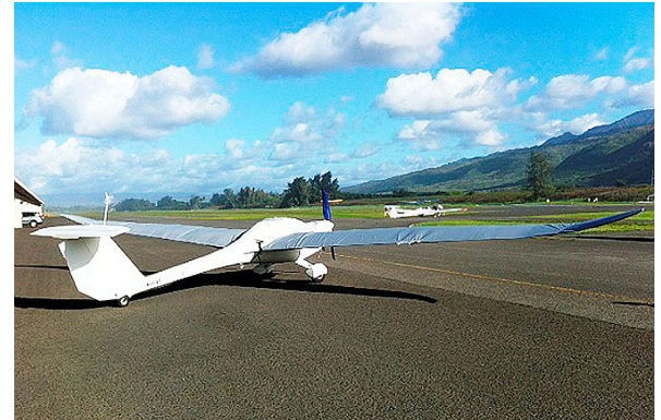
Grob 109 Canopy/Engine w/ extension to tail, Wing, Stabilizer & Prop/Spinner Covers Lambada Canopy/Engine Cover and Wing Covers