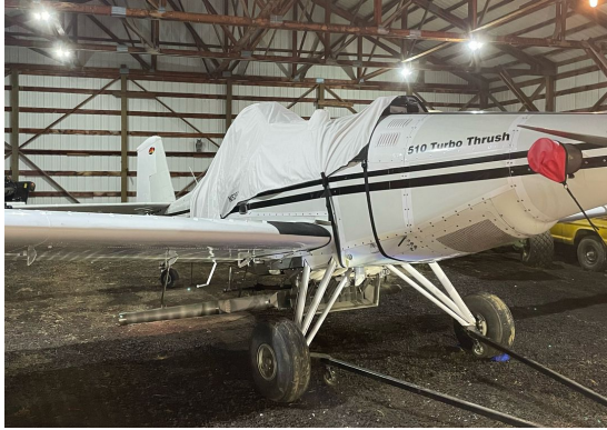
Thrush Aircraft S2R-T34 Canopy Cover, & Prop Tie/Exhaust Covers

This cover type is made from Silver Acrylic Sunbrella canvas and is 100% lined with a soft and smooth microfiber. Bruce's Custom Covers developed this material combination especially for aircraft protection. The outer material is medium weight and treated for water resistance, UV resistance and anti-static buildup. The inner lining is a very soft and smooth microfiber to prevent scratching. The material is very reflective, and tests show that the cabin interior temperature can be reduced to near-ambient temperature on the hottest of days. It is water, ice and snow repellent, yet breathable to allow moisture to escape from between the cover and the aircraft surface.