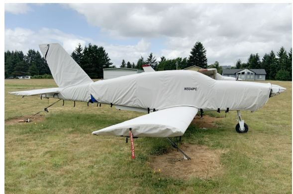
Socata Tampico TB-9C Cover Set