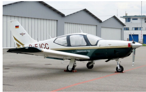
Socata Tobago TB20 Heatshields