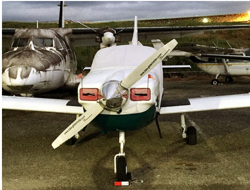
Socata TB9 Tampico Canopy Cover and Engine Inlet Plugs

Engine Inlet Plugs are custom fit for your Socata Tampico, Tobago & Trinidad intakes, made with heavy-duty vinyl material, and stuffed with a single block of sculpted urethane foam. Each plug has a zipper that allows the foam to be removed and dried if necessary. Engine plugs have warning flags that are visible from the cockpit or 'remove before flight' streamers sewn onto the face of the plugs. Most plugs are imprinted with the aircraft registration number in black for an extra charge. Storage bag NOT included. Engine plugs may be inserted after flight when the engine is still warm. Engine Inlet Plugs are commonly referred to as Cowl Plugs, Intake Plugs, Cowl Blocks, Engine Blocks, and Engine Bunges.