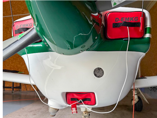
Trinidad TB20 Engine Inlet Plugs (set of 3)