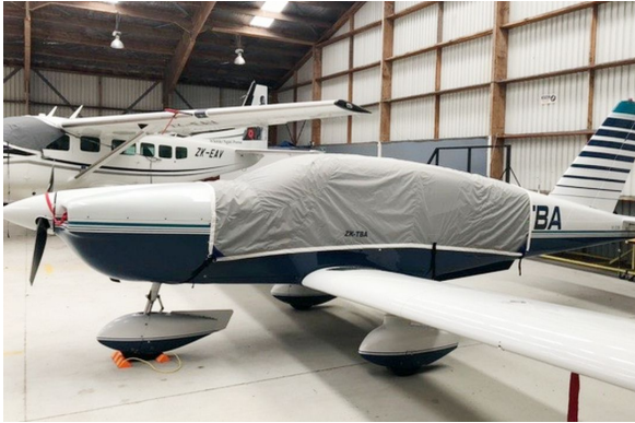
Socata TB-9 TRAVEL COVER, Light Weight Canopy Cover

Travel Covers are made with Silver Solution-Dyed Polyester fabric and only lined over the windshield to save weight. The material is lightweight and more compact for easy stowage in the aircraft. The polyester material is water resistant, but only intended for occasional use outside. We also have an ultra lightweight material available for fitted hangar dust covers. For daily outdoor use, the non-travel Sunbrella Cover is the best choice.