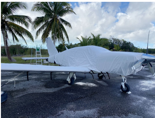
Socata Trinidad Full Cover Set

WINTER USE MATERIAL - Made with Solution-Dyed Polyester fabric, this option is intended for seasonal use to aid in deicing, rain mitigation, or for occasional travel. The material is lighter and more compact, but more susceptible to UV damage and may have a shorter useful life if used continuously outside than the all-year use material.