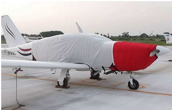
Socata TB-20/21 Extended Canopy Cover and Insulated Engine Cover

This cover type is made from Silver Acrylic Sunbrella canvas and is 100% lined with a soft and smooth microfiber. Bruce's Custom Covers developed this material combination especially for aircraft protection. The outer material is medium weight and treated for water resistance, UV resistance and anti-static buildup. The inner lining is a very soft and smooth microfiber to prevent scratching. The material is very reflective, and tests show that the cabin interior temperature can be reduced to near-ambient temperature on the hottest of days. It is water, ice and snow repellent, yet breathable to allow moisture to escape from between the cover and the aircraft surface.