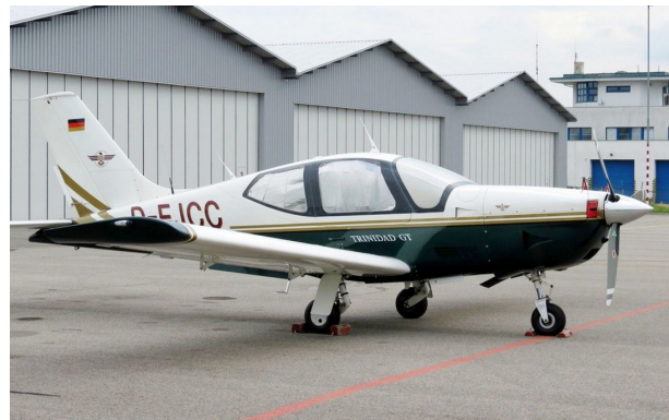
Socata Tobago TB20 Heatshields