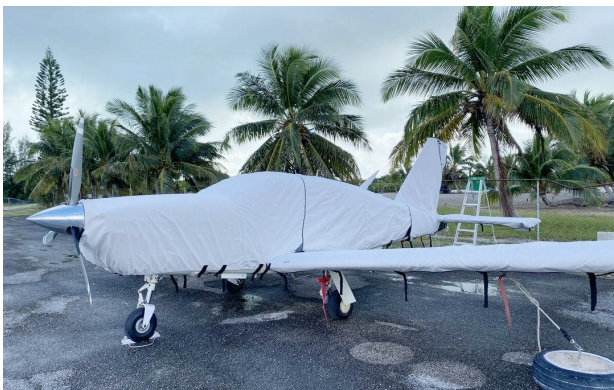
Socata Trinidad Full Cover Set

This cover type is made from Silver Acrylic Sunbrella canvas and is 100% lined with a soft and smooth microfiber. Bruce's Custom Covers developed this material combination especially for aircraft protection. The outer material is medium weight and treated for water resistance, UV resistance and anti-static buildup. The inner lining is a very soft and smooth microfiber to prevent scratching. The material is very reflective, and tests show that the cabin interior temperature can be reduced to near-ambient temperature on the hottest of days. It is water, ice and snow repellent, yet breathable to allow moisture to escape from between the cover and the aircraft surface.