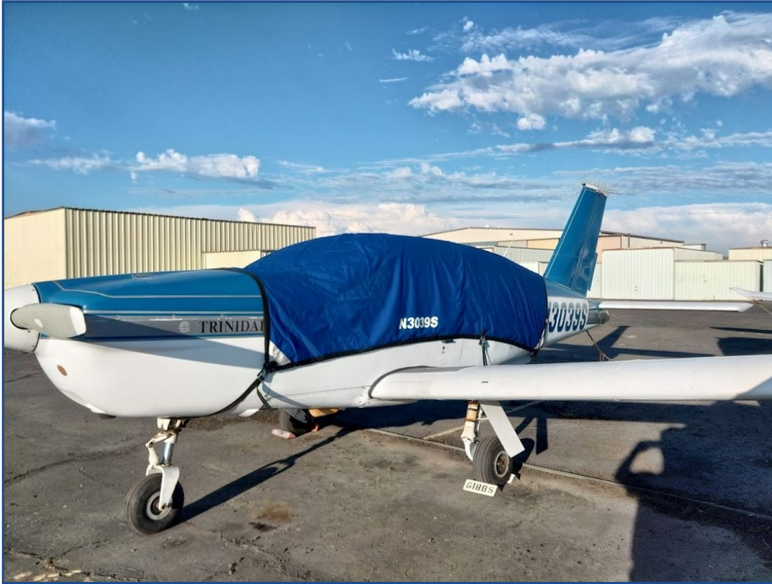
Socata TB-20 Trinidad Canopy Cover, Custom Color Upgrade