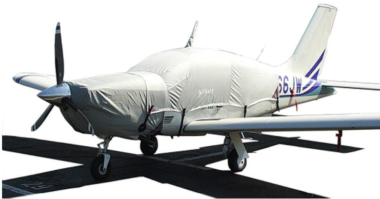
Trinidad/Tobago Canopy Cover & Engine Covers

This cover type is made from Silver Acrylic Sunbrella canvas and is 100% lined with a soft and smooth microfiber. Bruce's Custom Covers developed this material combination especially for aircraft protection. The outer material is medium weight and treated for water resistance, UV resistance and anti-static buildup. The inner lining is a very soft and smooth microfiber to prevent scratching. The material is very reflective, and tests show that the cabin interior temperature can be reduced to near-ambient temperature on the hottest of days. It is water, ice and snow repellent, yet breathable to allow moisture to escape from between the cover and the aircraft surface.