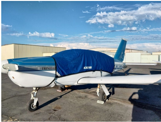
Socata TB-20 Trinidad Canopy Cover, Custom Color Upgrade

This cover type is made from Silver Acrylic Sunbrella canvas and is 100% lined with a soft and smooth microfiber. Bruce's Custom Covers developed this material combination especially for aircraft protection. The outer material is medium weight and treated for water resistance, UV resistance and anti-static buildup. The inner lining is a very soft and smooth microfiber to prevent scratching. The material is very reflective, and tests show that the cabin interior temperature can be reduced to near-ambient temperature on the hottest of days. It is water, ice and snow repellent, yet breathable to allow moisture to escape from between the cover and the aircraft surface.