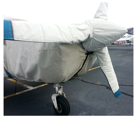
Socata Trinidad/Tobago Engine & Prop Covers