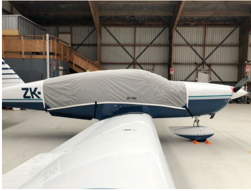
Socata TB-9 TRAVEL COVER, Light Weight Canopy Cover

Travel Covers are made with Silver Solution-Dyed Polyester fabric and only lined over the windshield to save weight. The material is lightweight and more compact for easy stowage in the aircraft. The polyester material is water resistant, but only intended for occasional use outside. We also have an ultra lightweight material available for fitted hangar dust covers. For daily outdoor use, the non-travel Sunbrella Cover is the best choice.