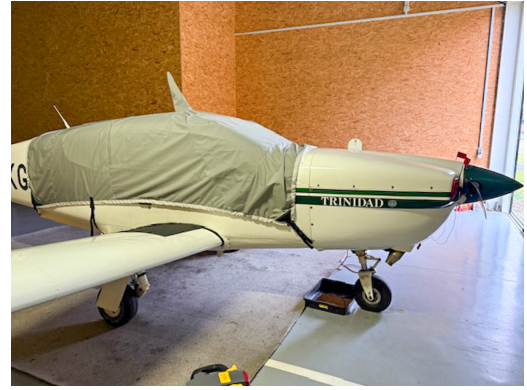
Trinidad TB20 Travel Cover, Light Weight Canopy Cover