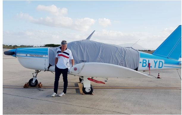
Socata Tampico, Tobago & Trinidad Travel Cover, Light Weight Canopy Cover