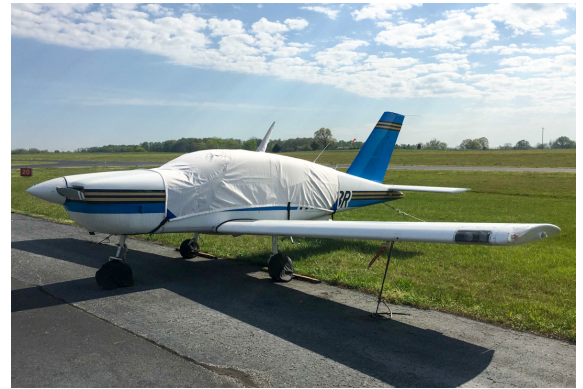
Socata TB-9 Canopy Cover