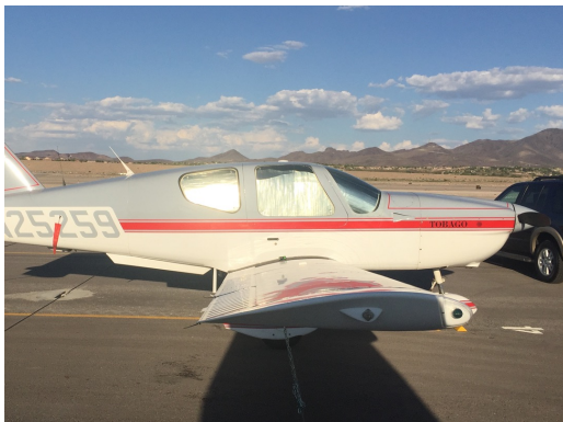
Socata TB-10 Cabin HeatShields

Windshield Heatshields are interior sunshades for an aircraft's front windshield. The product is a unique composite of closed-cell foam with a silver mylar finish. The semi-rigid design is stiff enough to stand along the inside of the windshield using sun visors or window framing. It folds up flat and easily stores in the included storage sleeve. Some designs may require velcro and suction cups or split right and left sides. A Heatshield is an excellent short-term remedy for cockpit overheating. An external fabric cover is far more effective and practical for long-term protection.