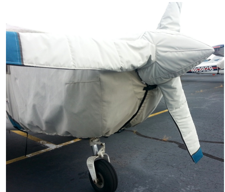
Socata Trinidad/Tobago Engine & Prop Covers