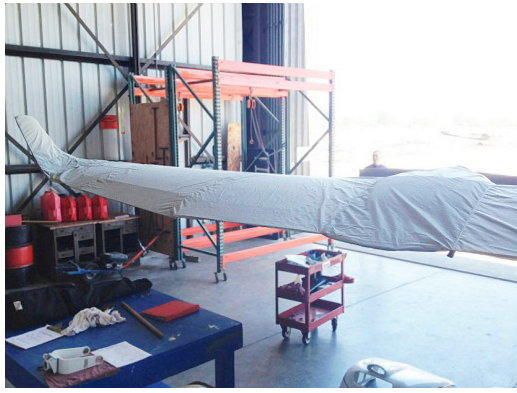
Tecnam Twin Wing/Engine Covers