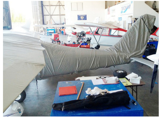
Tecnam Twin Wing & Empennage Covers