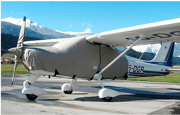
Tecnam Echo Extended Canopy, Engine, Prop Covers