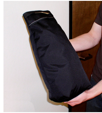
Light Weight Travel-Cover Mini-Storage Bag: 18" x 6" x 4"