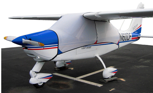
Tecnam Bravo Spandex FlyAway Travel Canopy Cover