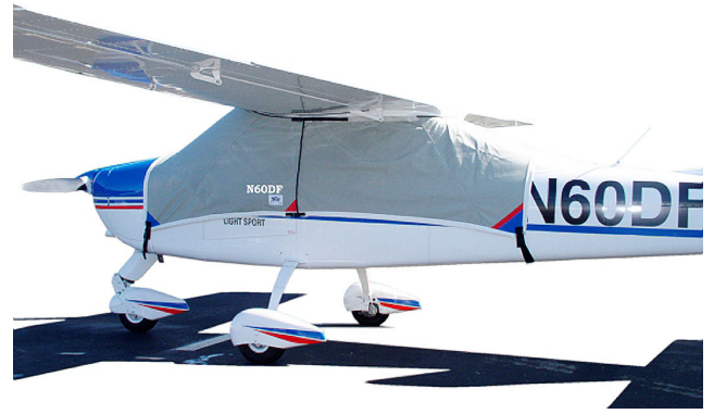
Tecnam Bravo Canopy Cover