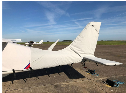
Tecnam P2008 Empennage Cover (Tailboom, Vertical & Horiz Stabilizers), All Year Use