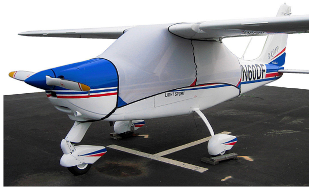
Tecnam Bravo Spandex FlyAway Travel Canopy Cover