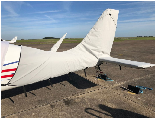
Tecnam P2008 Empennage Cover (Tailboom, Vertical & Horiz Stabilizers), All Year Use

WINTER USE MATERIAL - Made with Solution-Dyed Polyester fabric, this option is intended for seasonal use to aid in deicing, rain mitigation, or for occasional travel. The material is lighter and more compact, but more susceptible to UV damage and may have a shorter useful life if used continuously outside than the all-year use material.