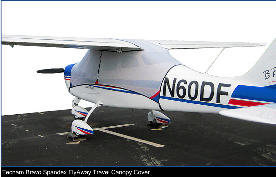
Tecnam Bravo Spandex FlyAway Travel Canopy Cover