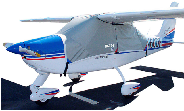
Tecnam Bravo Canopy Cover