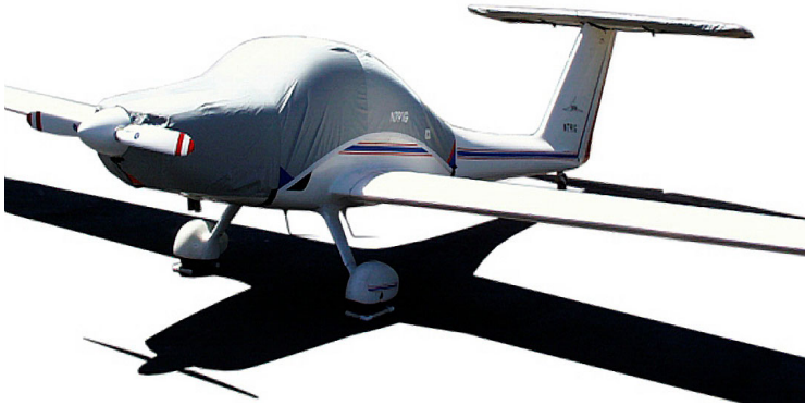
Grob 109 Canopy/Engine Cover & Horiz. Stabilizer Cover

WINTER USE MATERIAL - Made with Solution-Dyed Polyester fabric, this option is intended for seasonal use to aid in deicing, rain mitigation, or for occasional travel. The material is lighter and more compact, but more susceptible to UV damage and may have a shorter useful life if used continuously outside than the all-year use material.