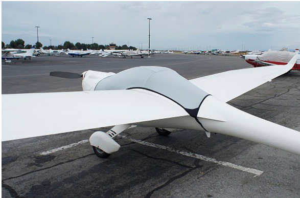
Lambda Canopy/Engine Cover and Wing Covers