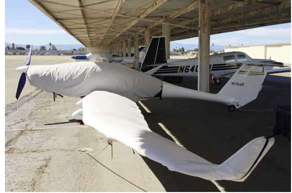
Phoenix Air U-15 Canopy/Engine, Wing & Horizontal Stabilizer Covers