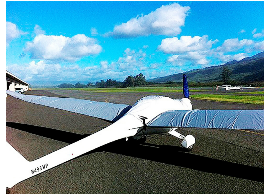
Lambda Canopy/Engine Cover and Wing Covers