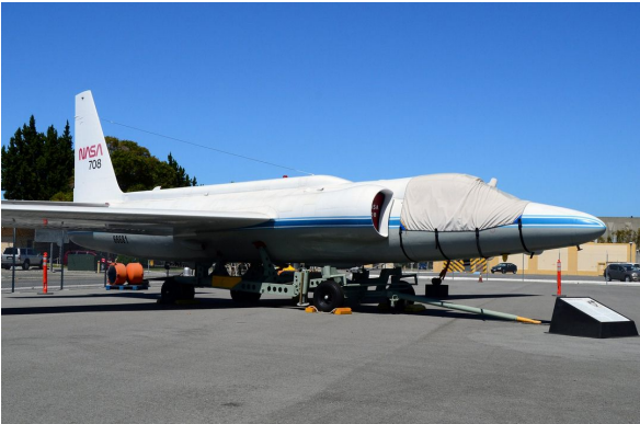
Lockheed U-2 Cockpit Cover