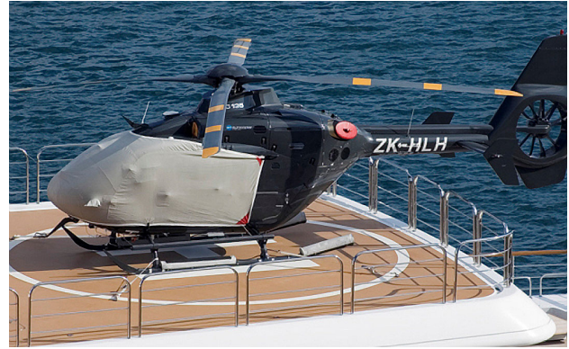
EC-135 Bubble Cover & Exhaust Plugs