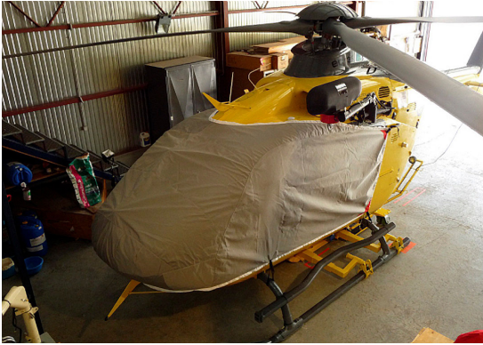
Eurocopter EC-135 Bubble Cover

Covers developed this material combination especially for aircraft protection. The outer material is medium weight and treated for water resistance, UV resistance and anti-static buildup. The inner lining is a very soft and smooth microfiber to prevent scratching. The material is very reflective, and tests show that the cabin interior temperature can be reduced to near-ambient temperature on the hottest of days. It is water, ice and snow repellent, yet breathable to allow moisture to escape from between the cover and the aircraft surface.